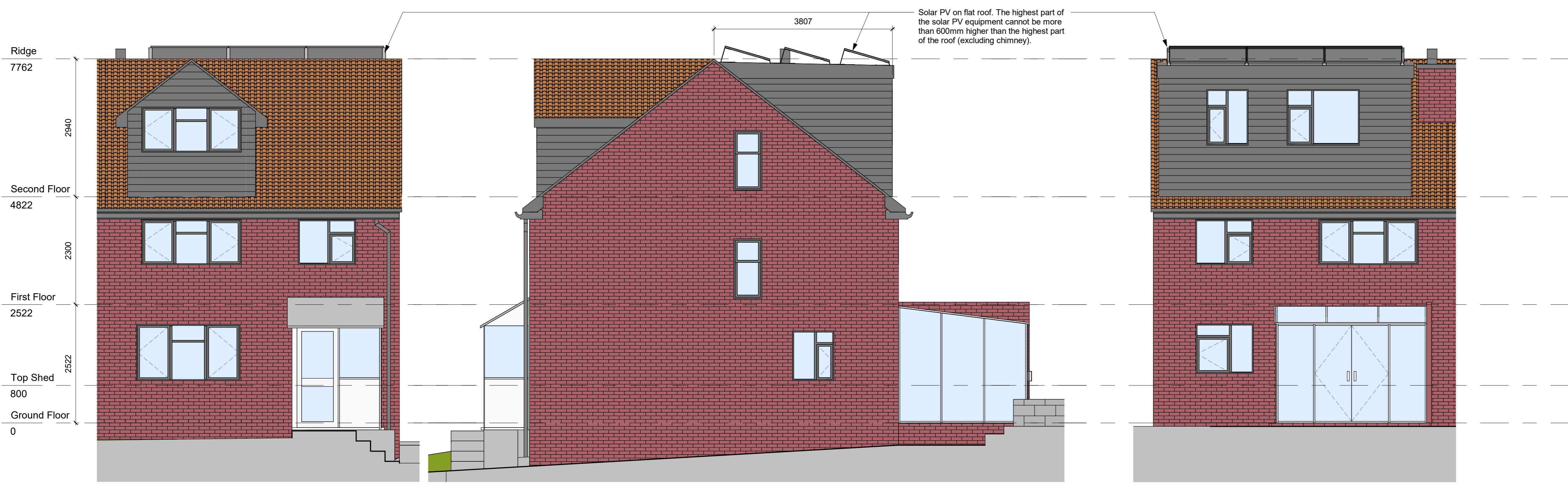
South Proposed 02 1 : 50