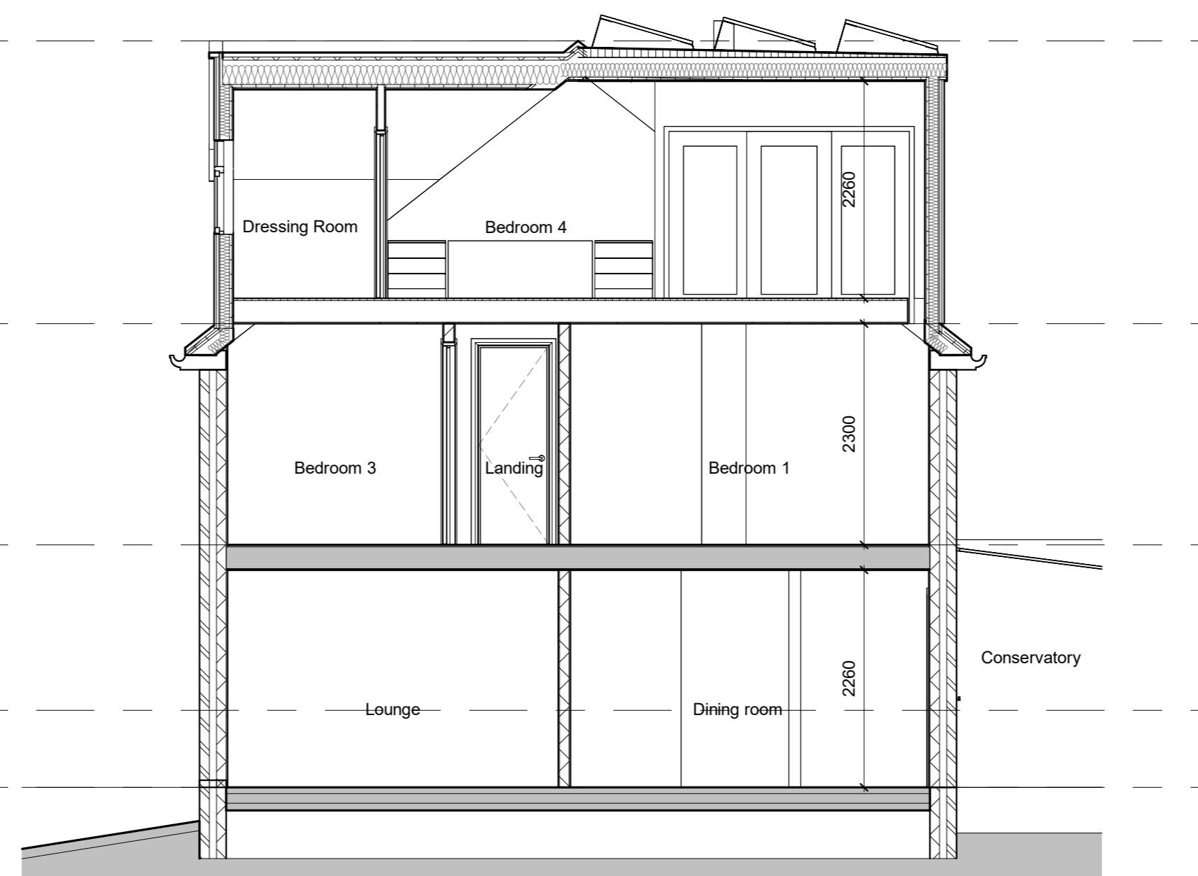
Section 2 - Proposed 01 1 : 50