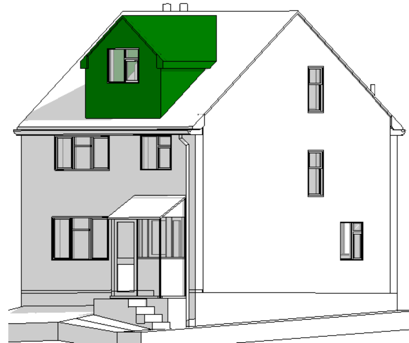
3D Dormer North Volume