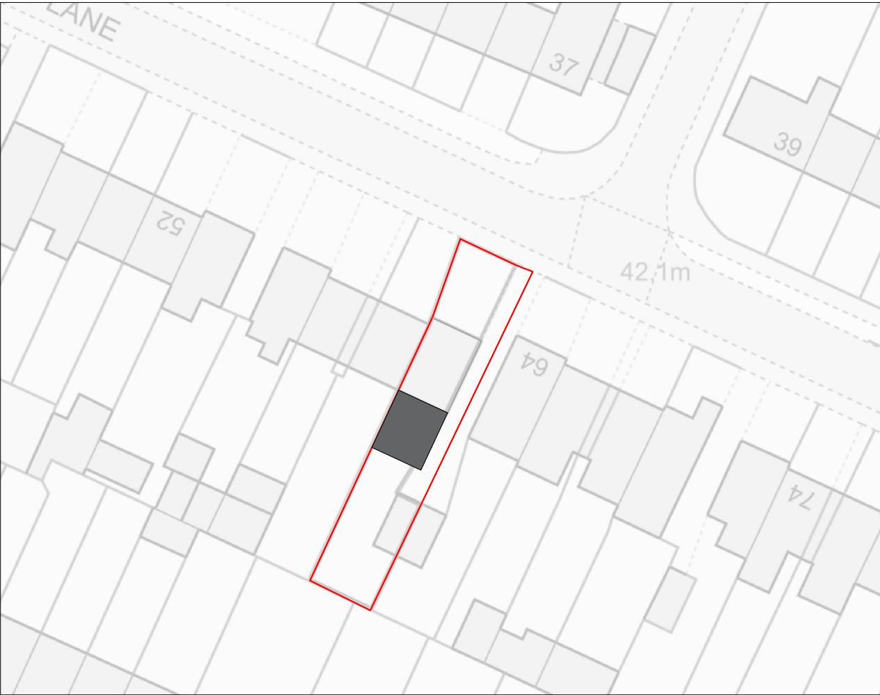
SITE PLAN Scale 1:500