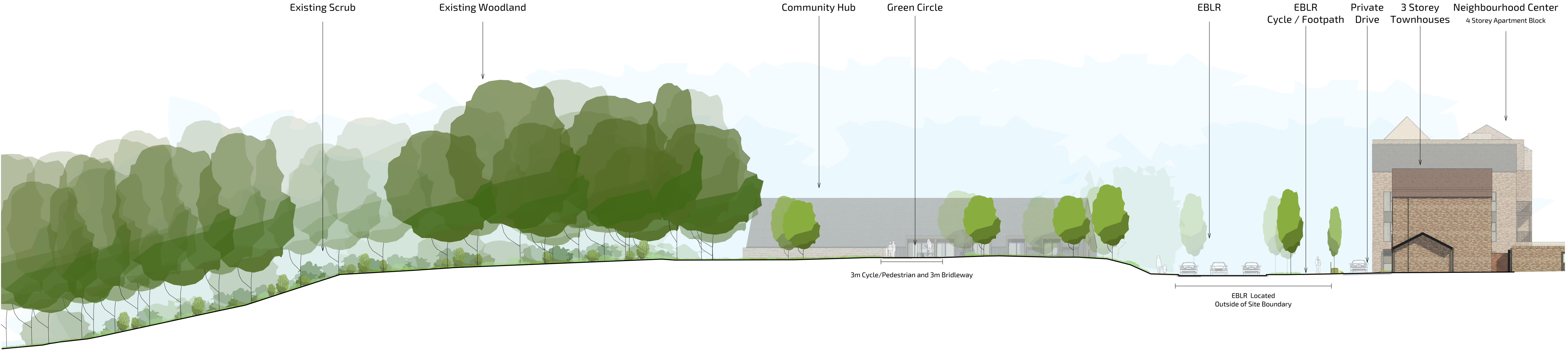
CROSS SECTION C - Eastern Parkland 1:200 @ A1