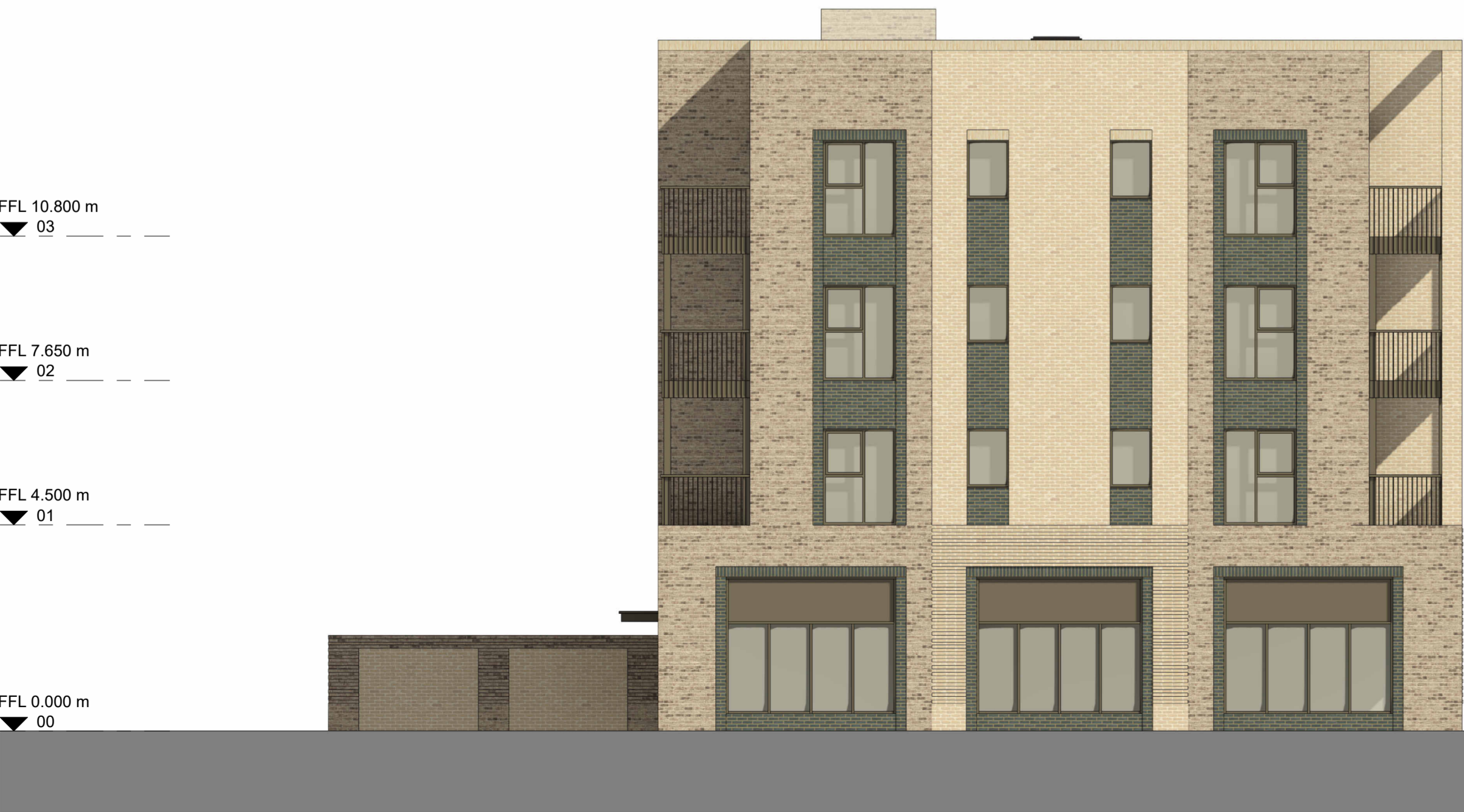
West Elevation 1 : 100