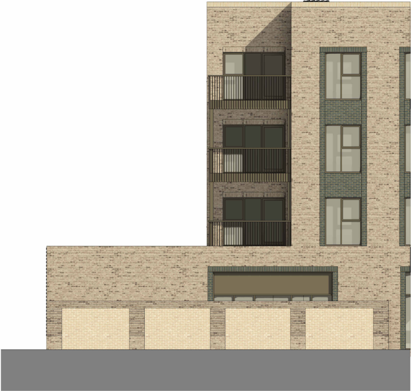
North Elevation (Outside Nursery Wall) 1 : 100