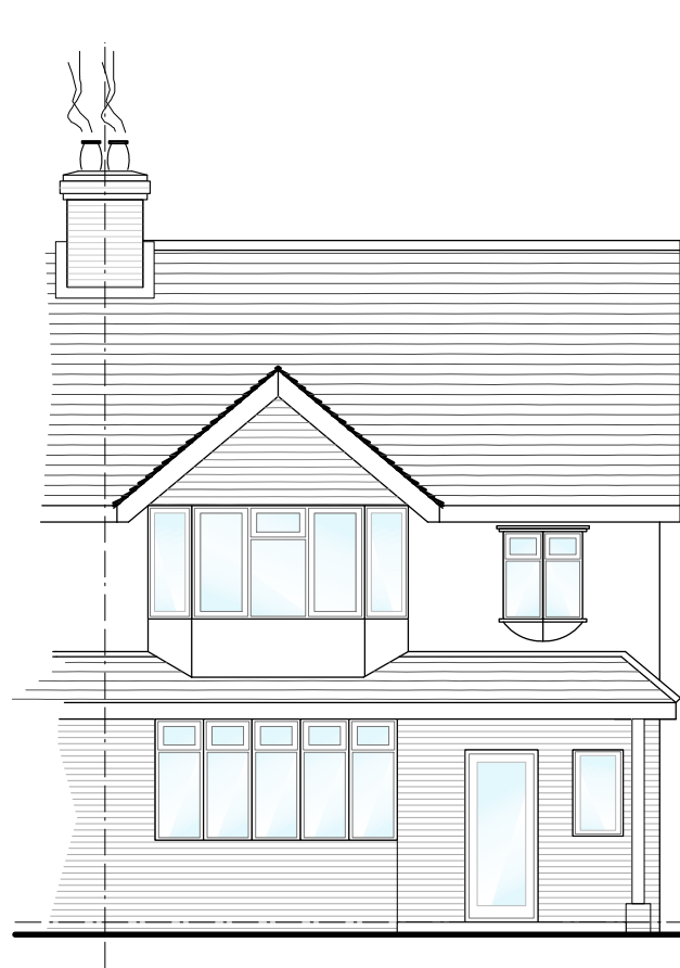
PROPOSED FRONT ELEVATION (Noth West Elevation)