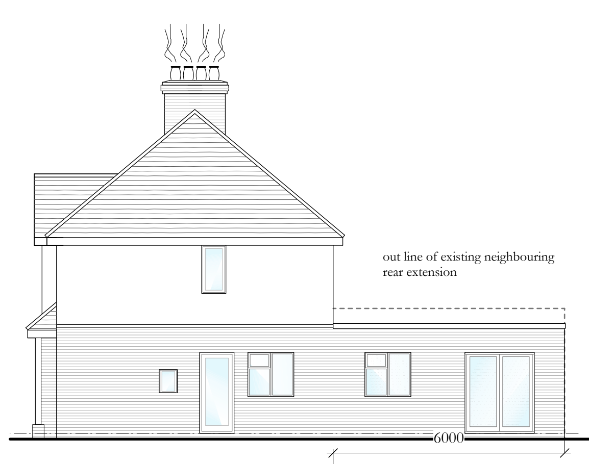
PROPOSED SIDE ELEVATION (South West Elevation)