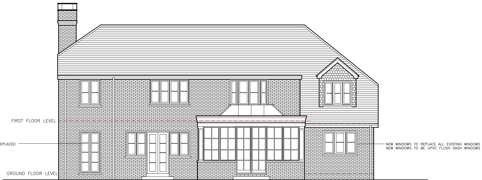
D) Proposed Rear Elevation