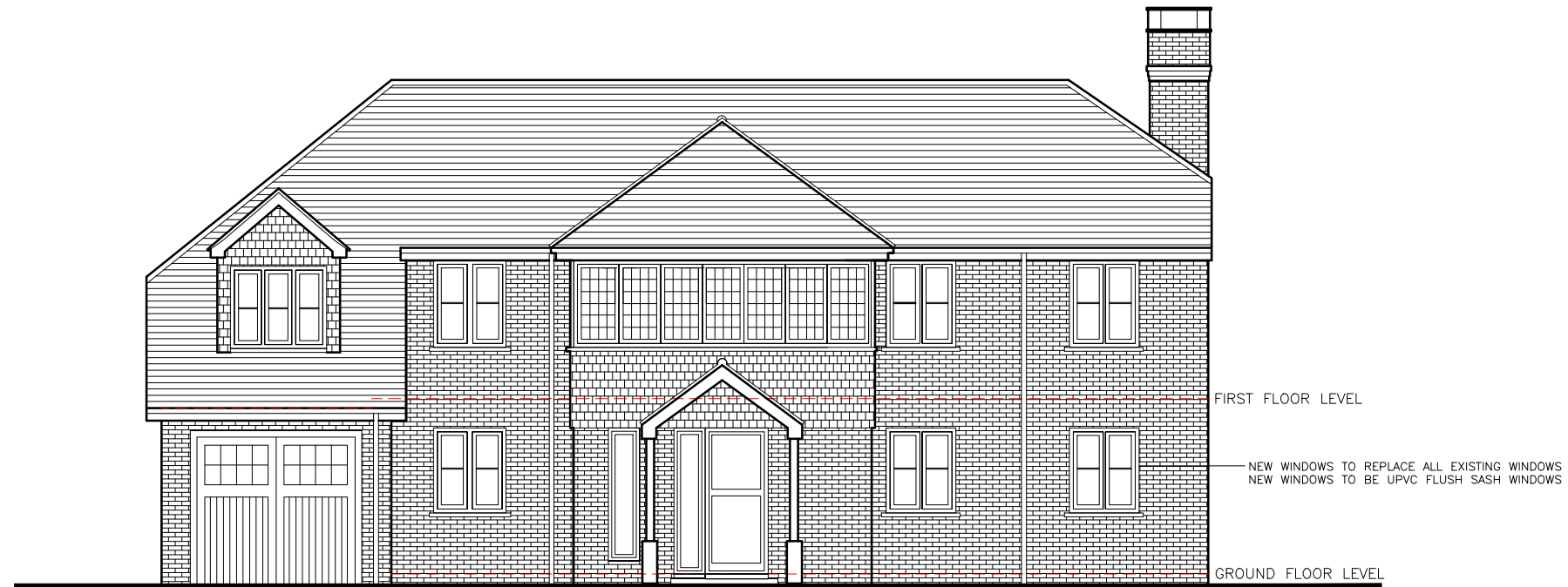
C) Proposed Front Elevation