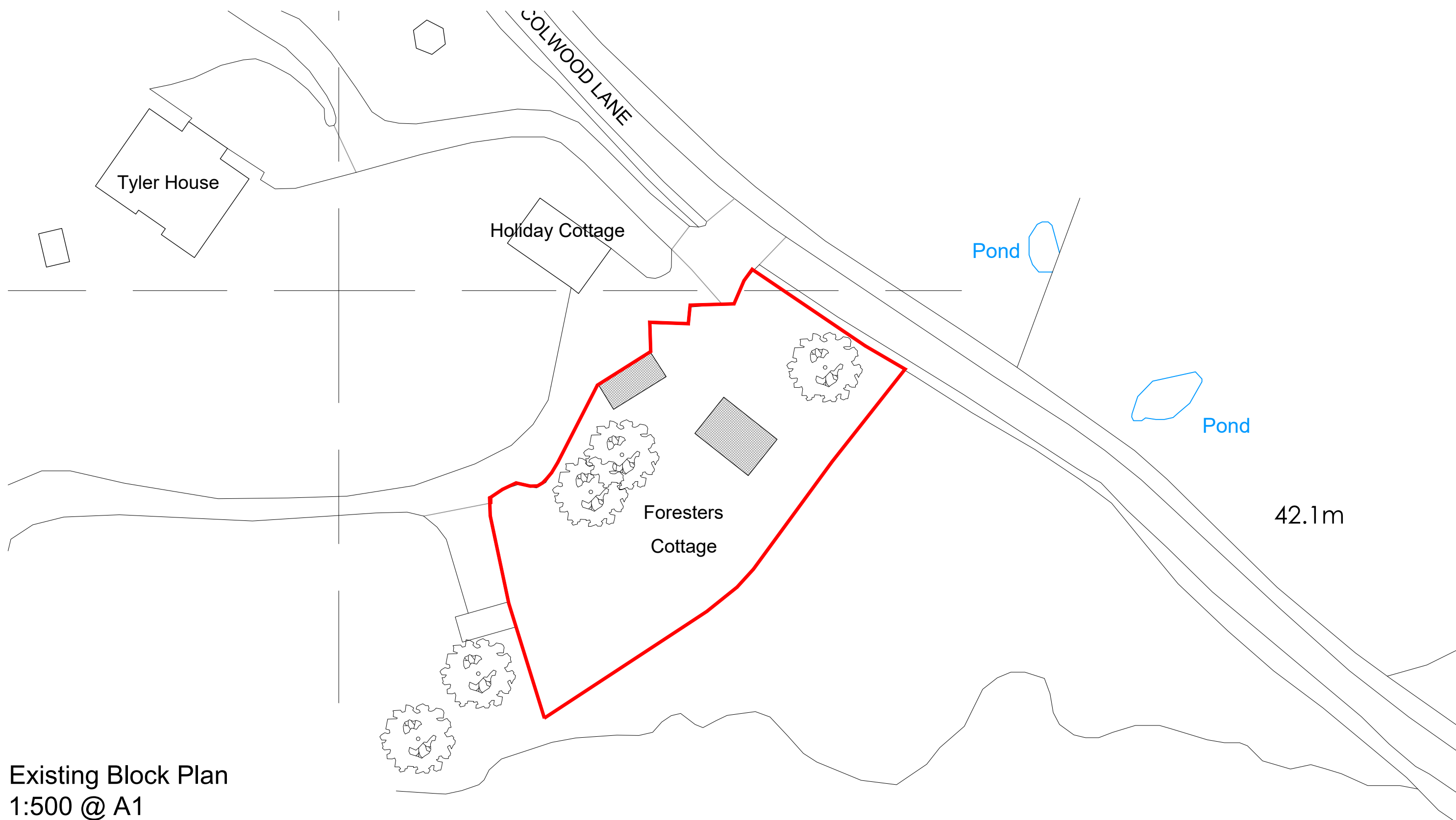
Existing Block Plan 1:500 @ A1