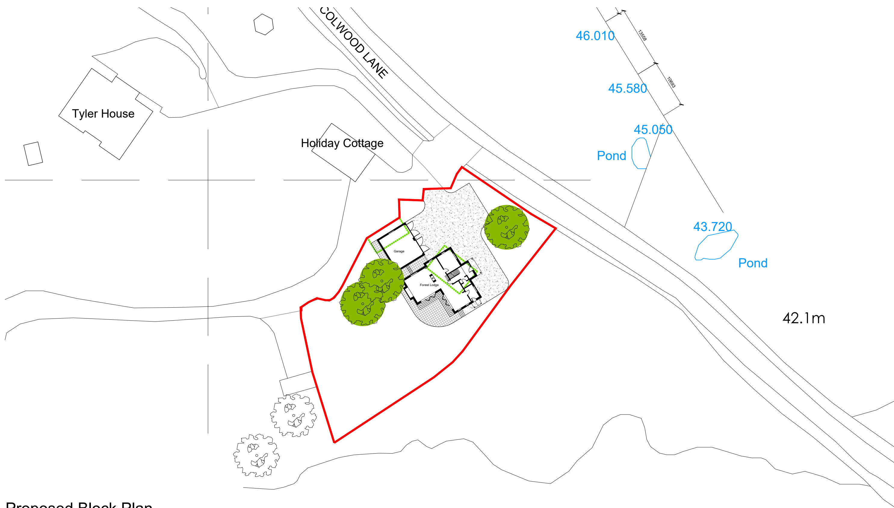
Proposed Block Plan 1:500 @ A1