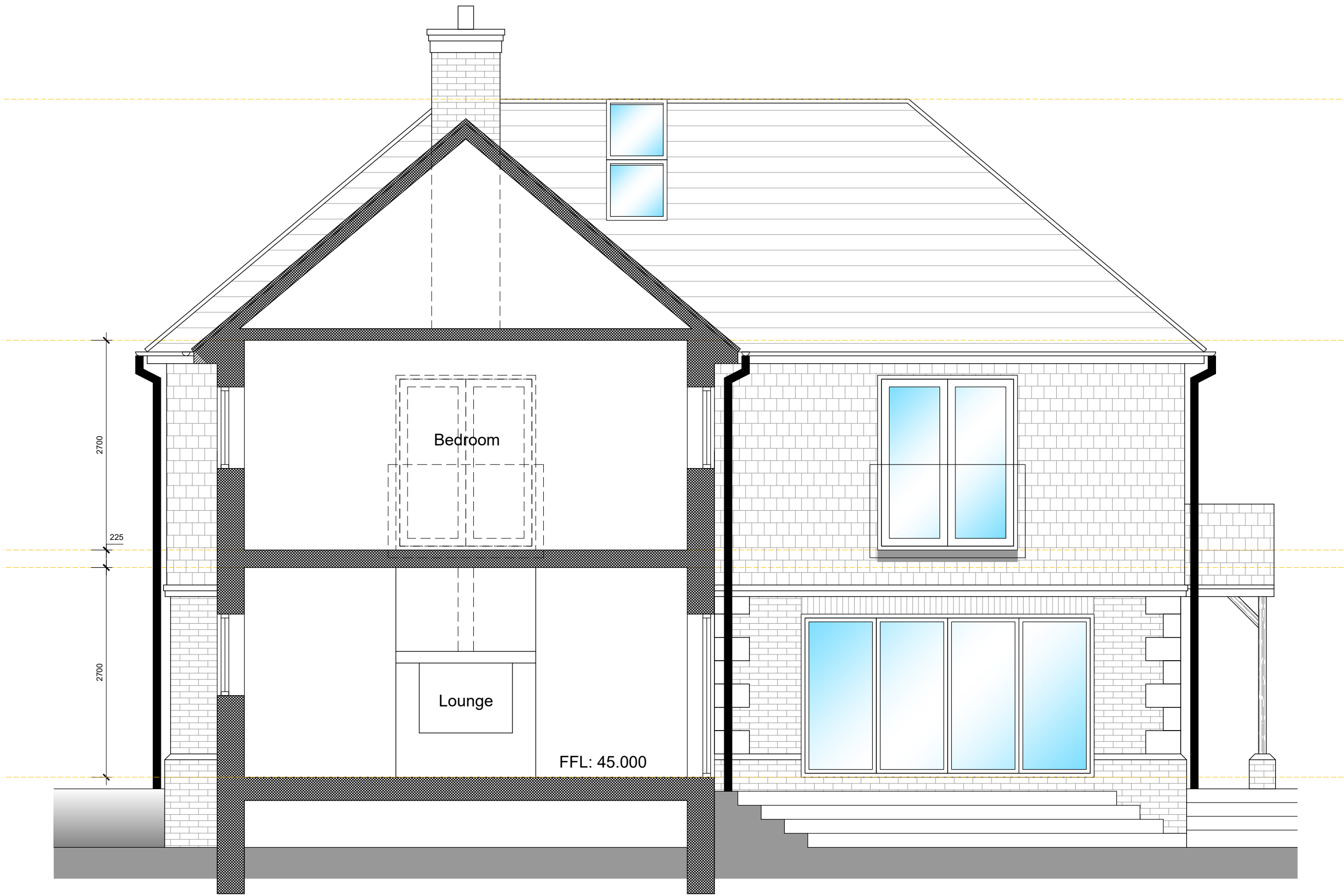
Proposed Section A 1:50 @ A1