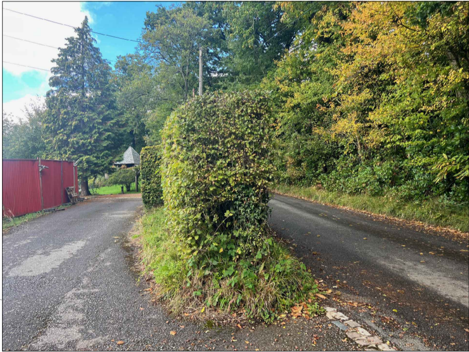
ACCESS VISIBILITY TO THE NORTHWEST