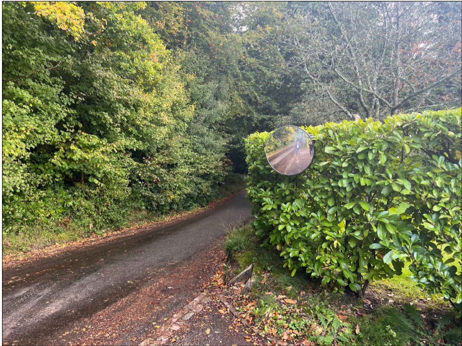
ACCESS VISIBILITY TO THE SOUTHEAST