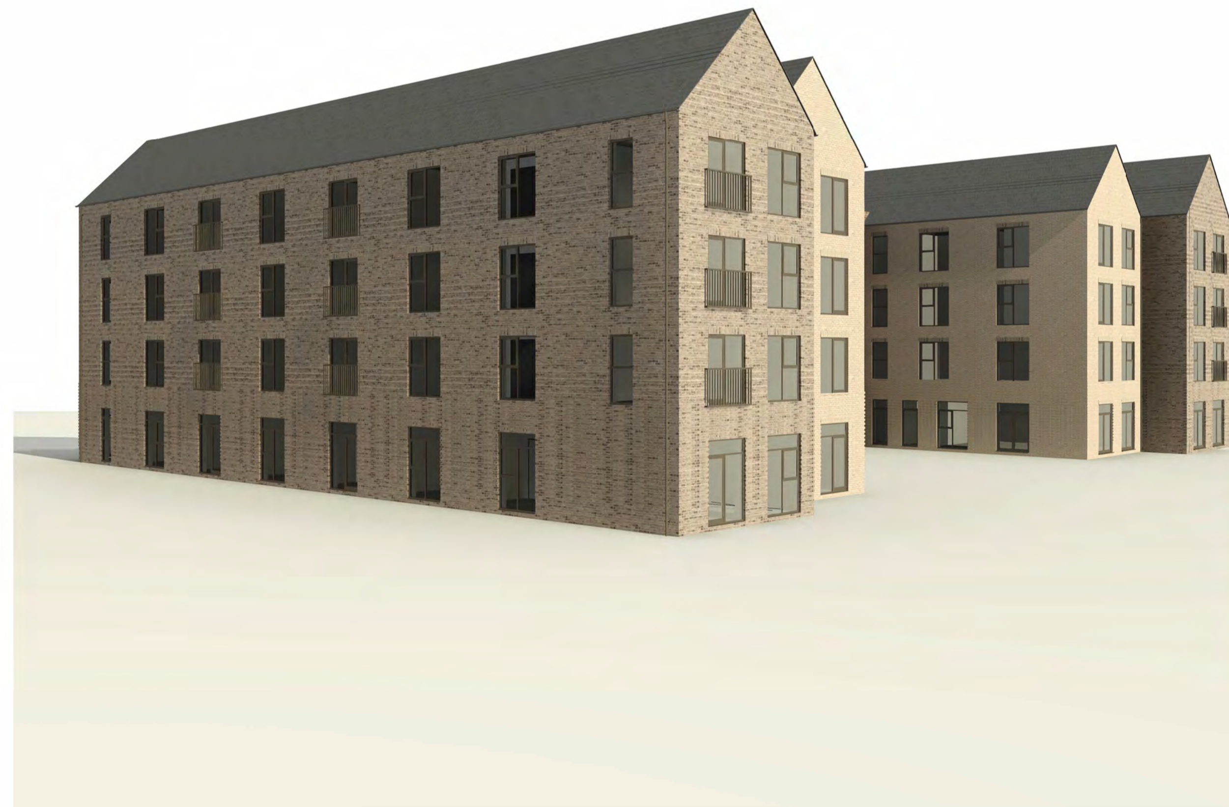
3D View 4

Notes Do not scale from this drawing. All contractors must visit the site and be responsible for taking and checking dimensions. All construction information should be taken from figured dimensions only. Any discrepancies between drawings, specifications and site conditions must be brought to the attention of the supervising officer. This drawing & the works depicted are the copyright of JTP. This drawing is prepared for the specific project stage in the Drawing Status section below and it is not intended to be used for any other purpose. Whilst all reasonable efforts are used to ensure drawings are accurate, JTP accept no liability for any reliance placed on, or use made of, this plan by anyone for purposes other than those stated in the Drawing Status below.