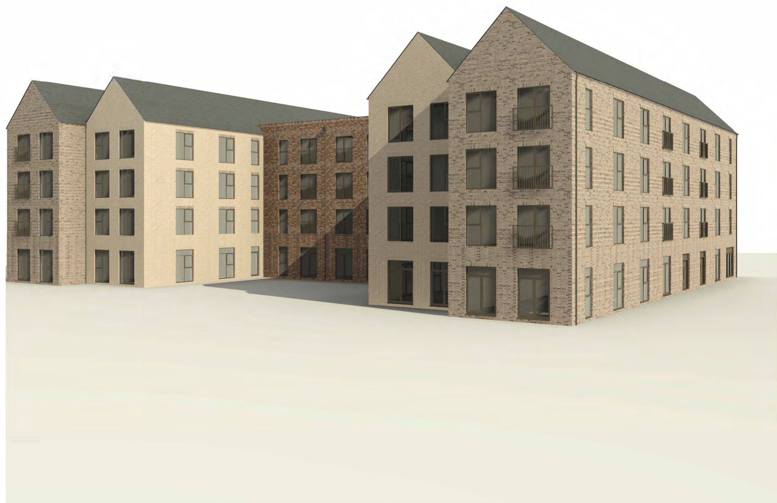
3D View 3