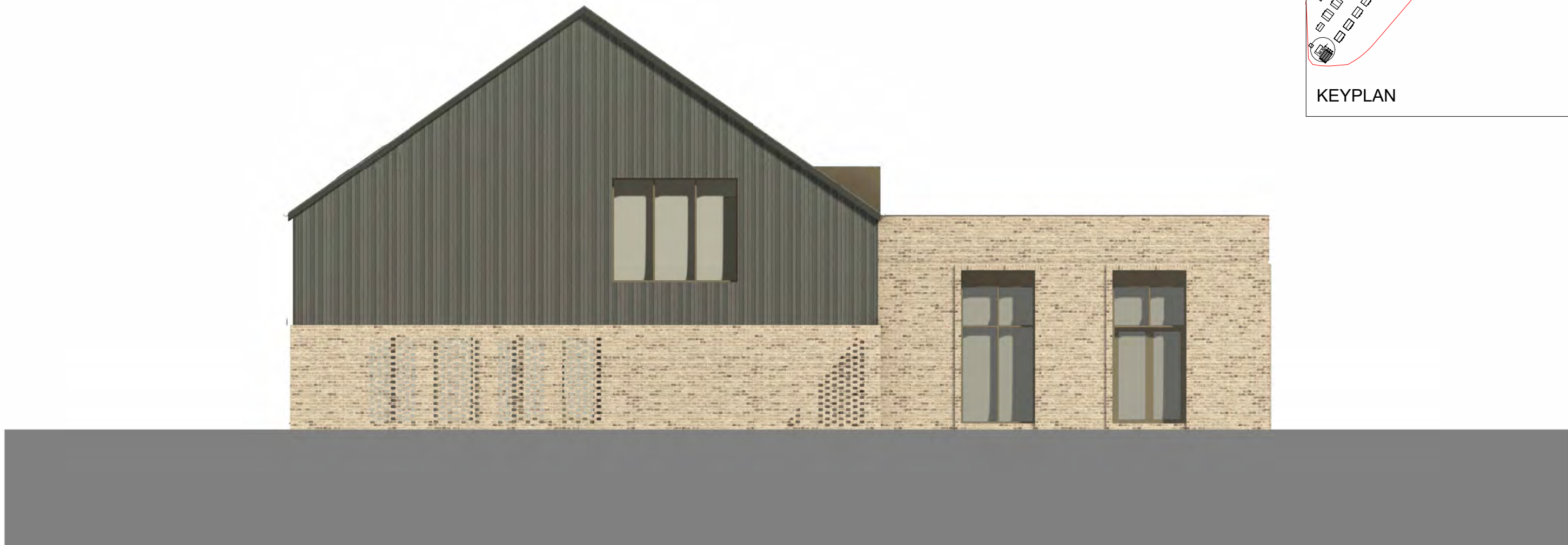
East Elevation (From Green Circle)