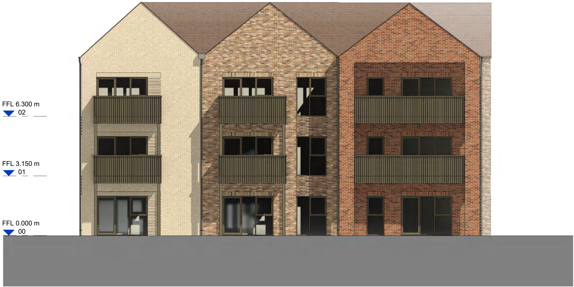
North Elevation 1 : 100