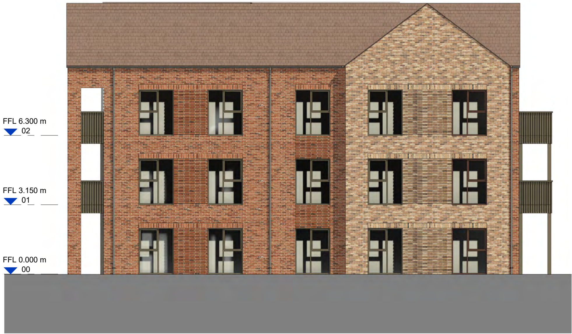
West Elevation 1 : 100