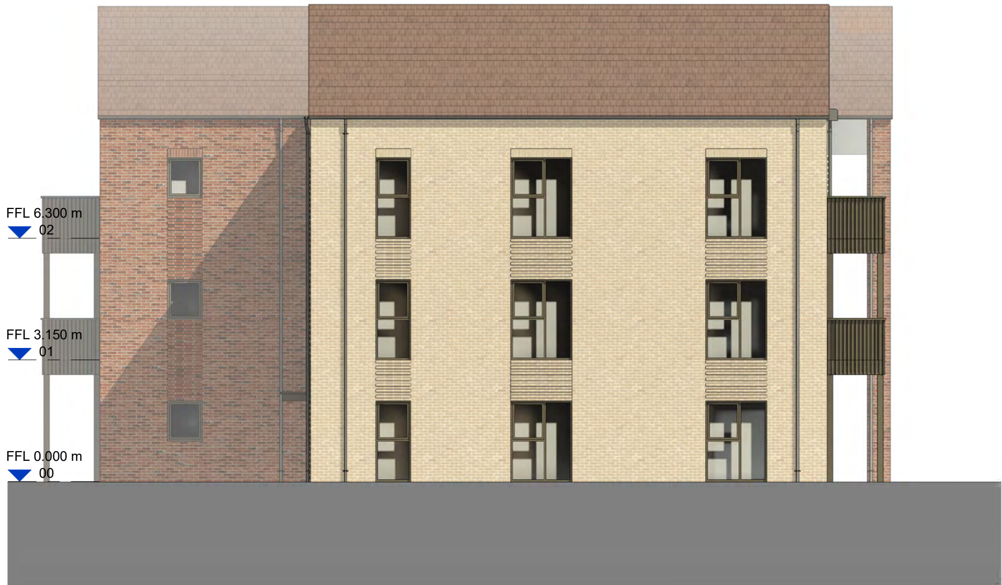
East Elevation 1 : 100