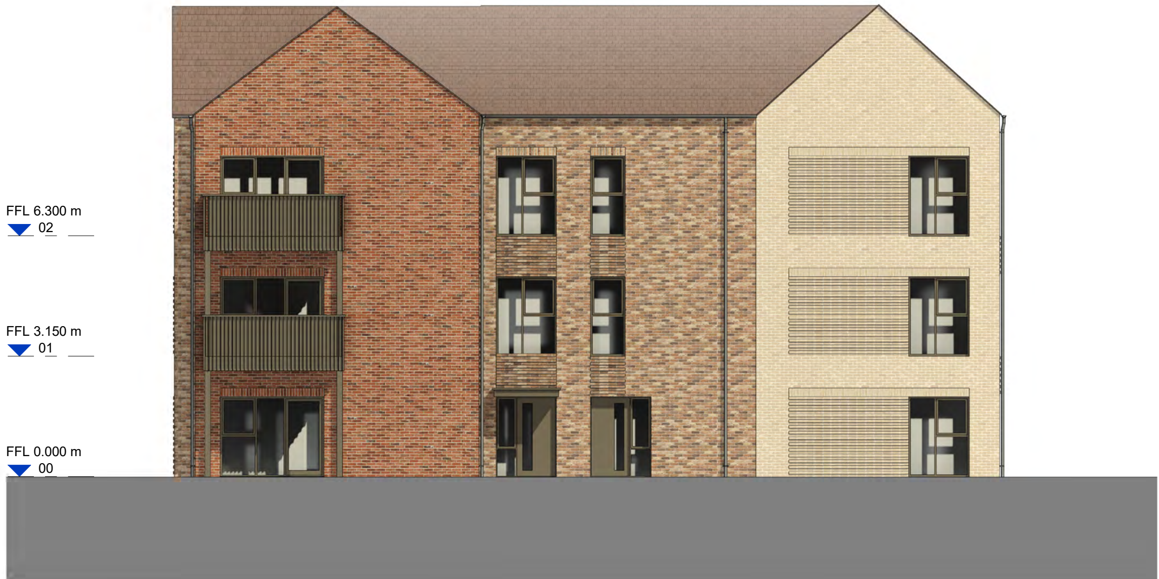
South Elevation 1 : 100