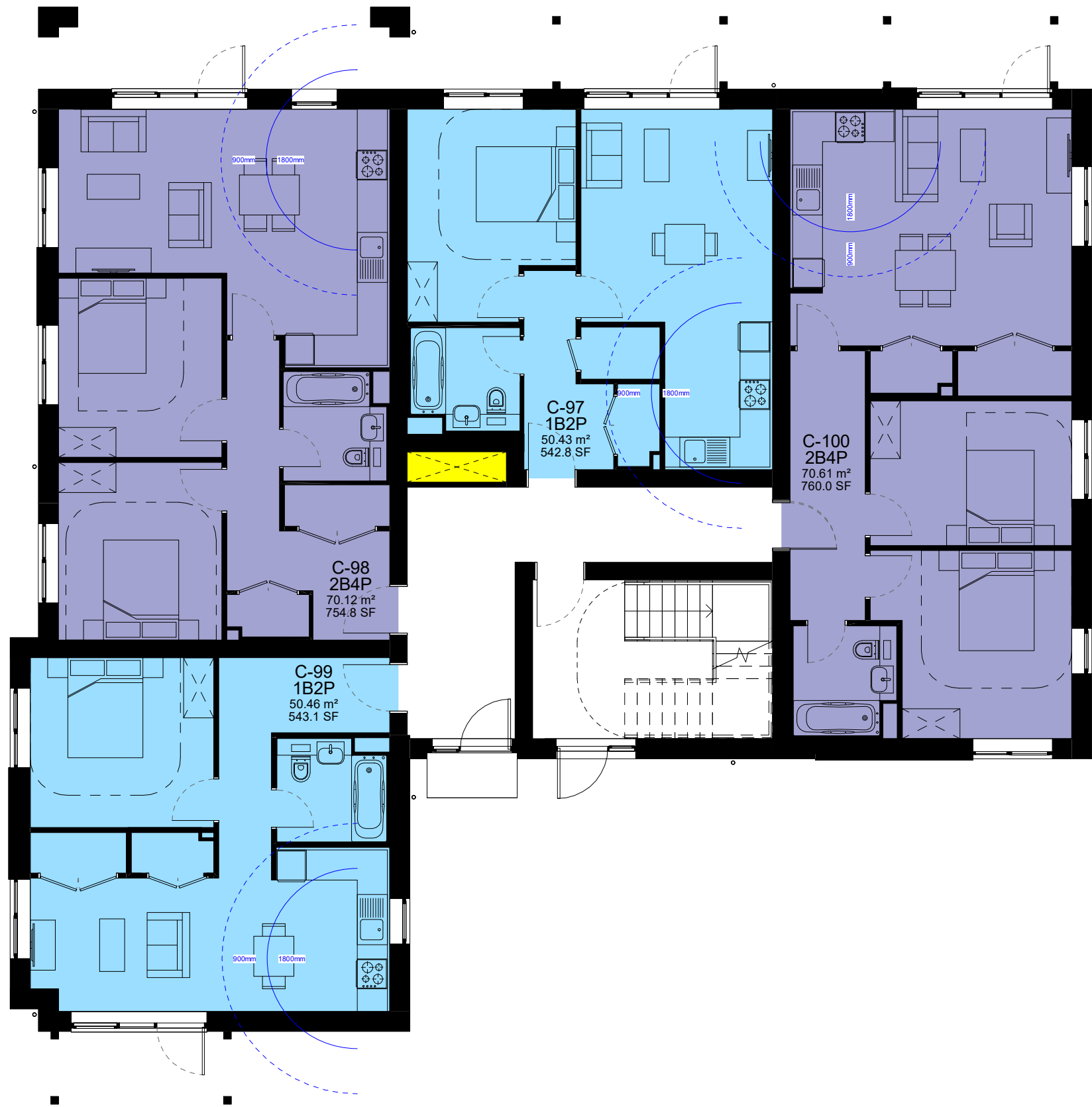
Level 00 1 : 100