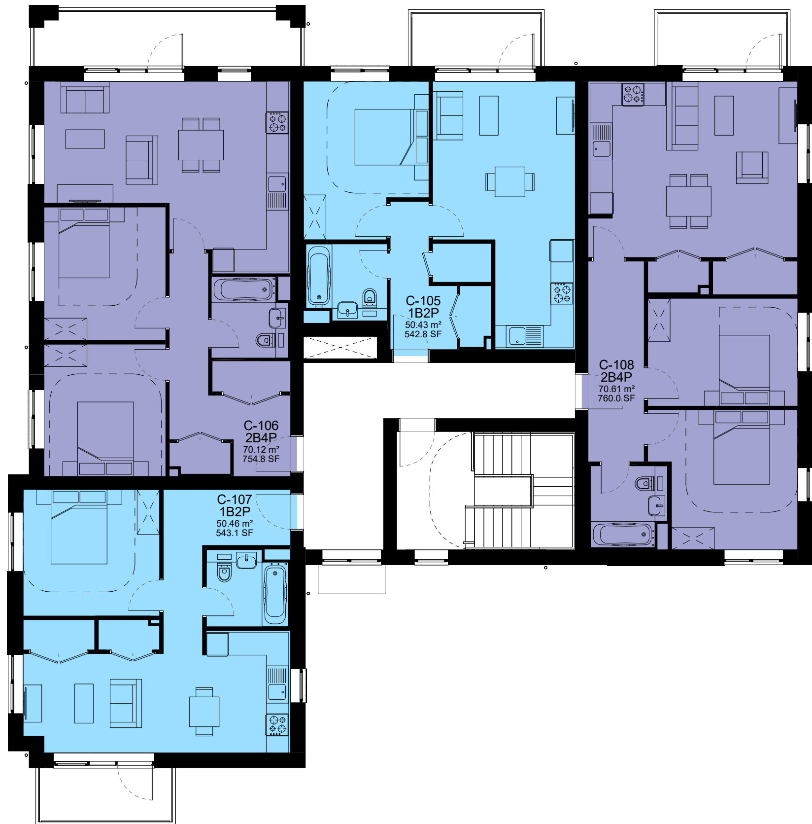
Level 01 1 : 100