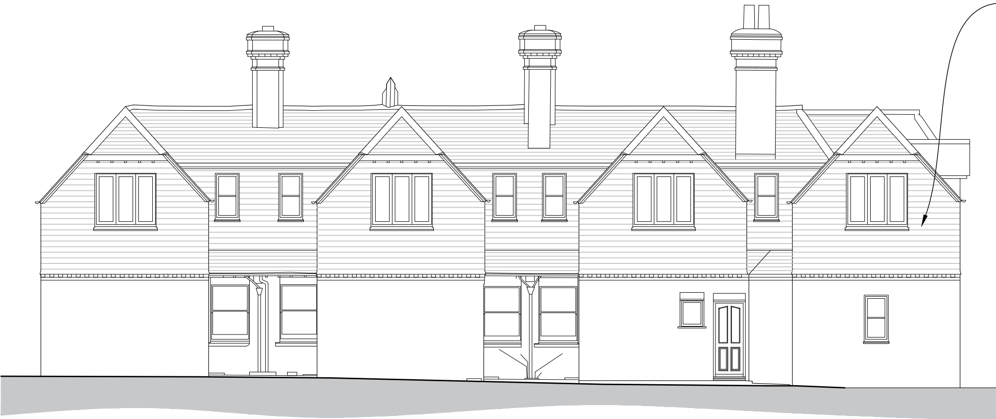
2 West Elevation Proposed 1:100

Do Not Scale. All dimensions and conditions are to be checked on site prior to preparing drawings or commencing any work. © This drawing is the property of Cerowski Architects Ltd. and protected by the Copyright, Designs and Patents Act, 1988.