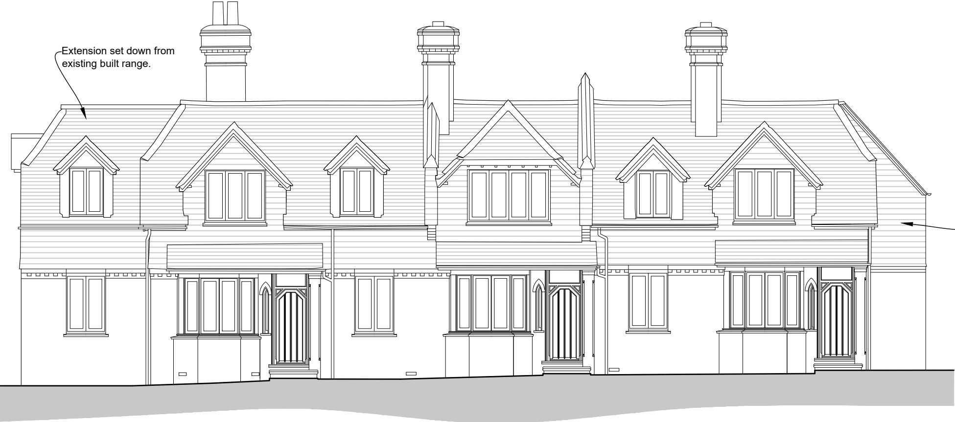
1 East Elevation Proposed 1:100 0 0.5 1.0 2.0 3.0 4.0 5.0 10.0 Scale in metres