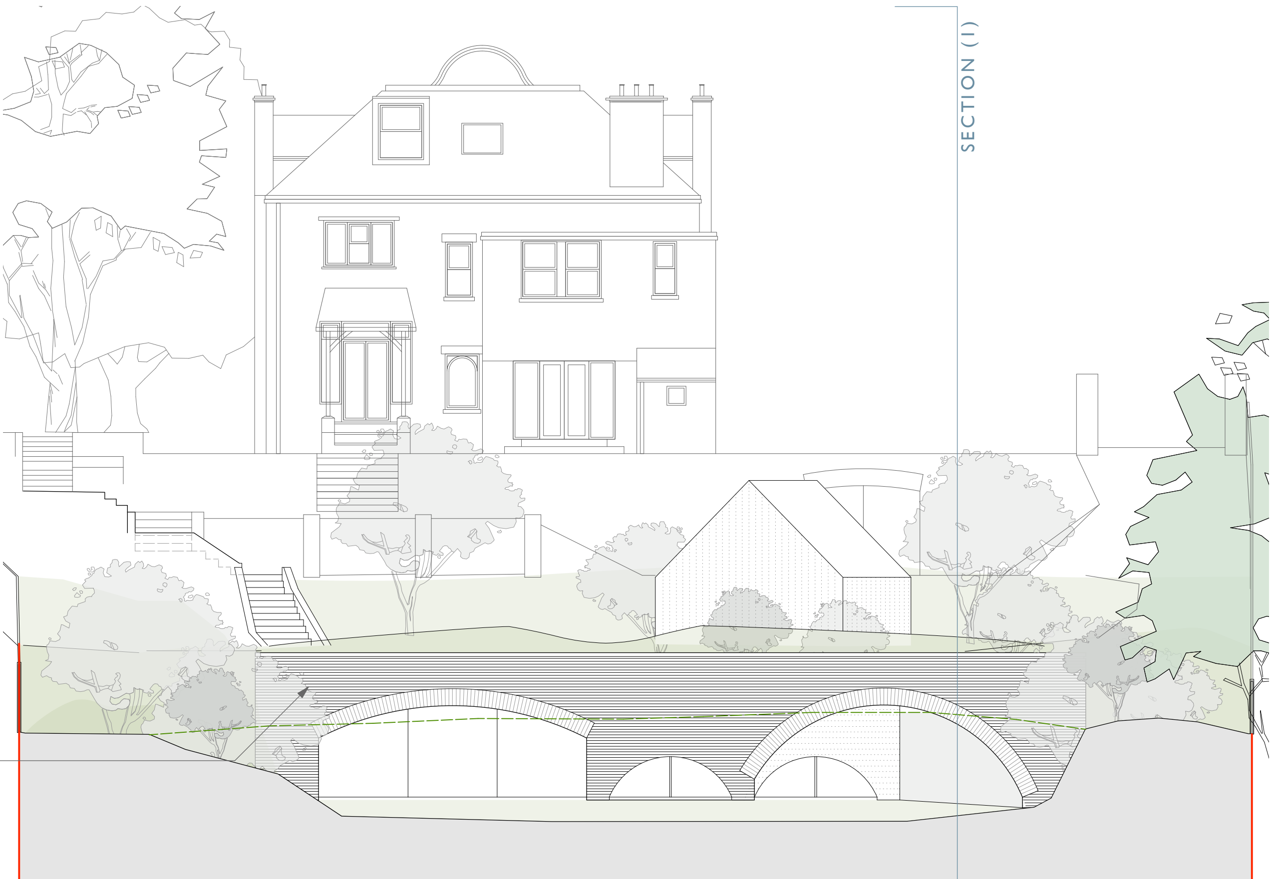
3. GARDEN HOUSE ELEVATION