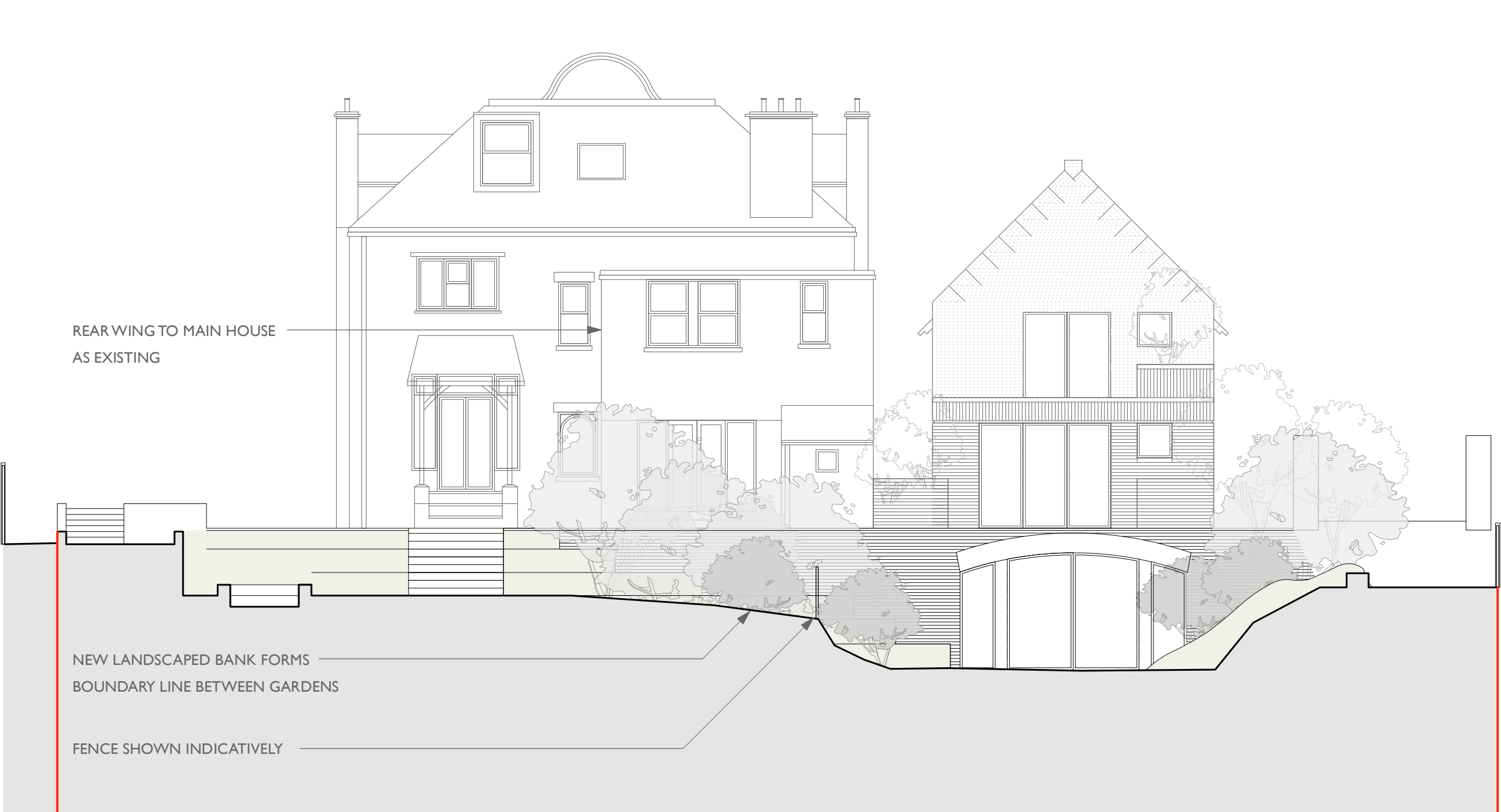
2. NORTH ELEVATION