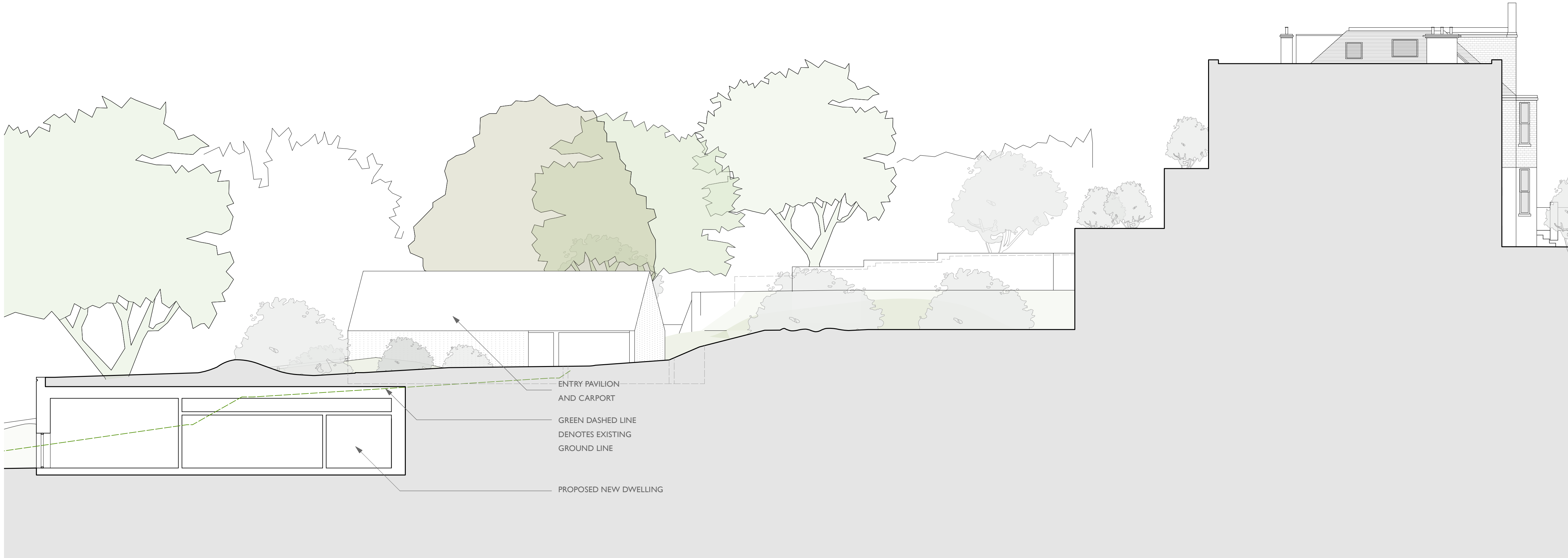
I. SECTION THROUGH PROPOSED DWELLING