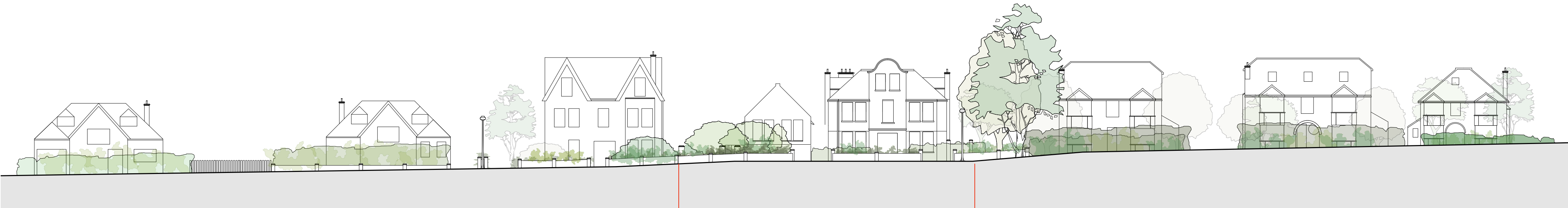
AS PROPOSED STREET ELEVATION