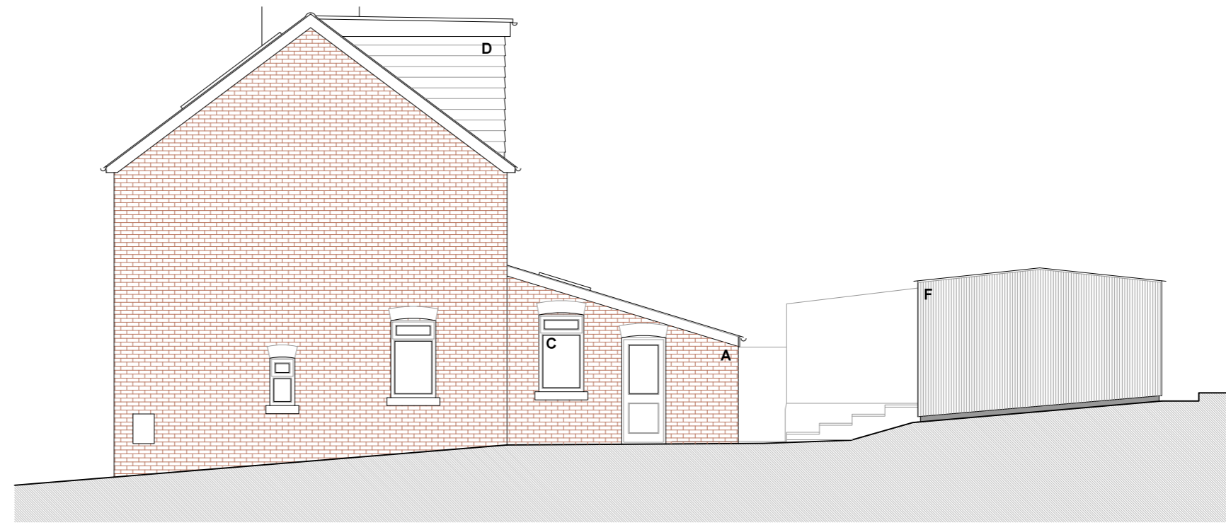
120.4 SECTION (south)