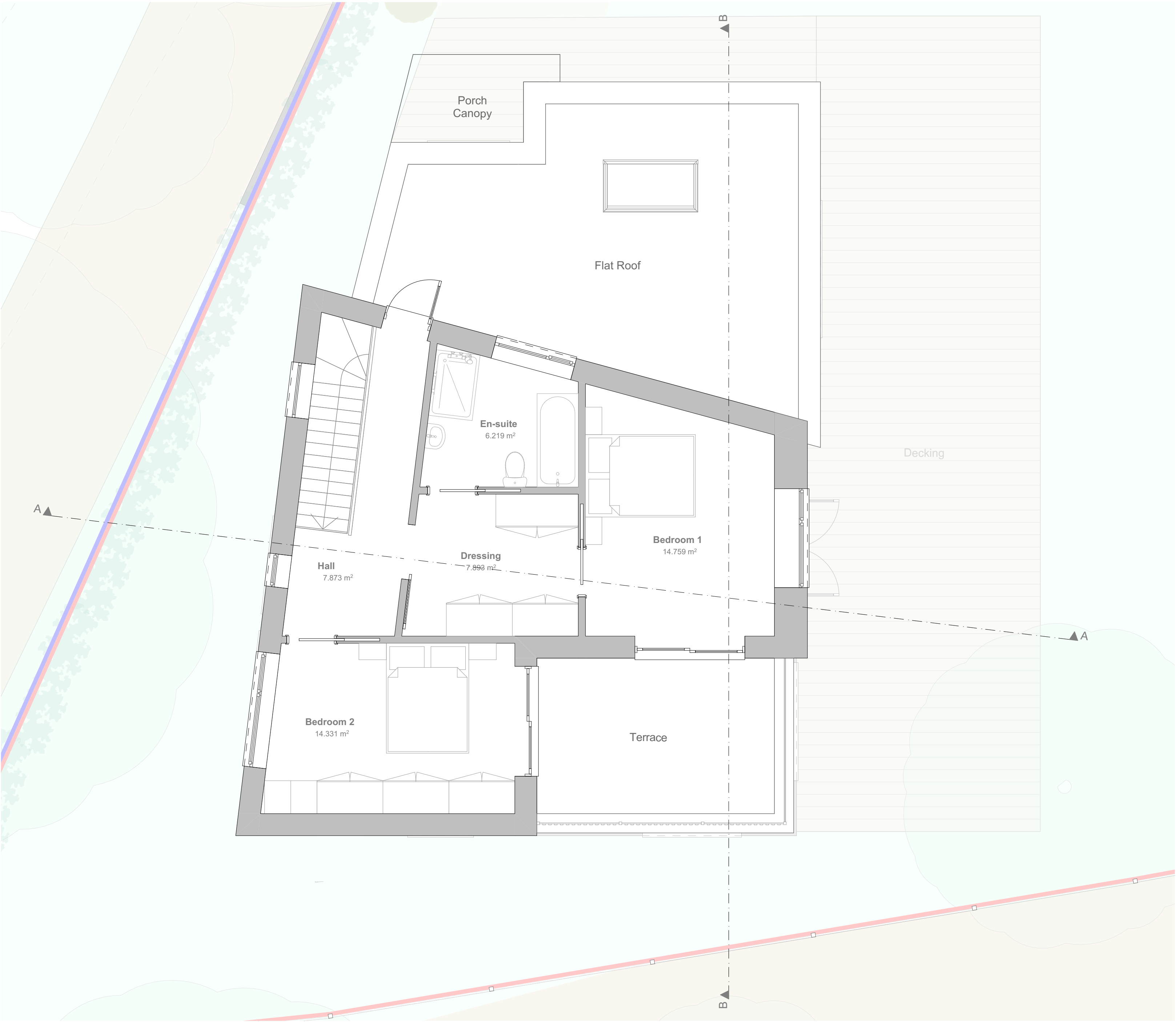
Proposed First Floor

Do not scale off this drawing except for planning purposes Check all dimensions on site before any work commences All goods, materials and workmanship must conform to current building regulations, british standards and codes of practice. Copyright of this drawing is to be retained by Ecotecture Ltd and must not be reproduced without written consent from the practice.