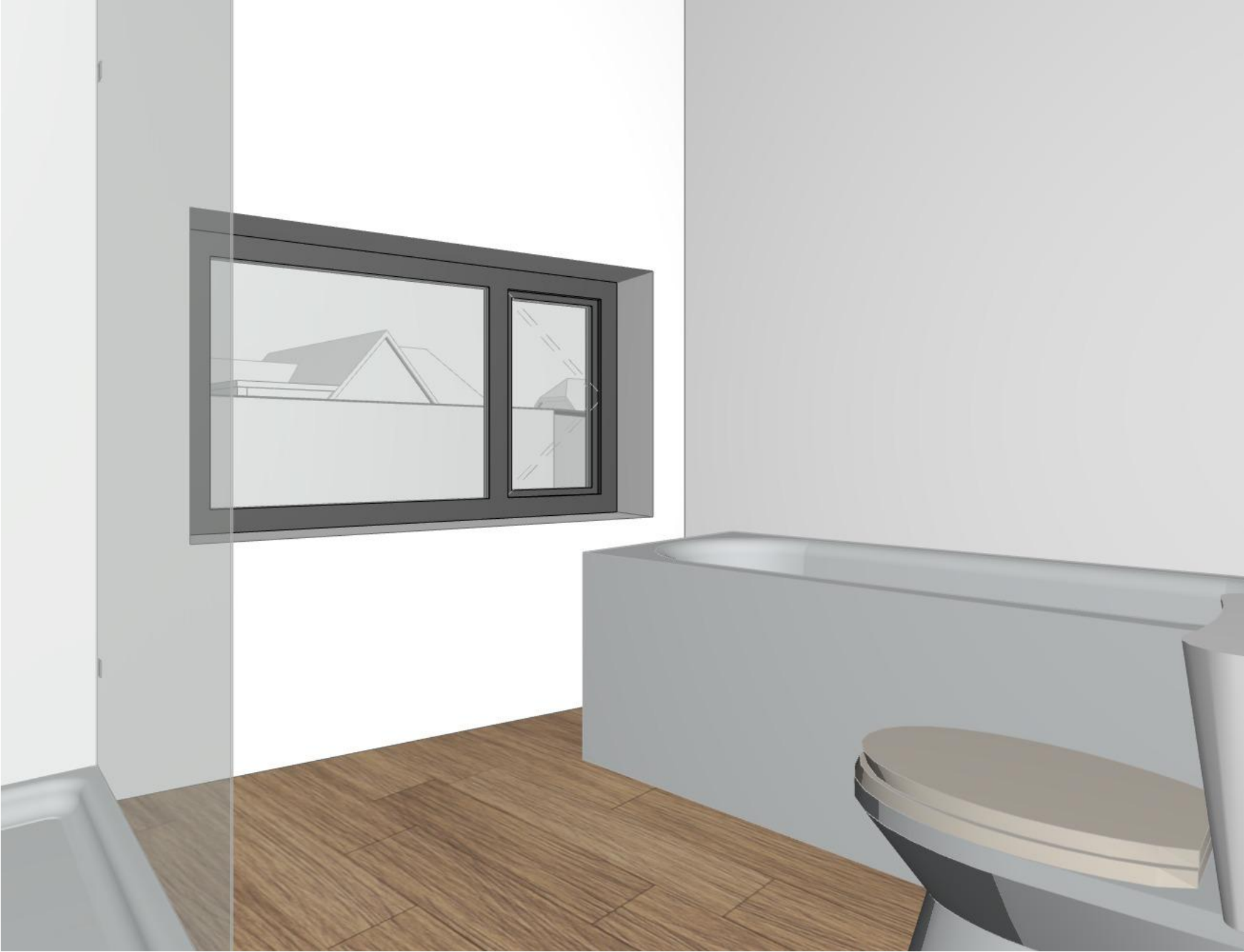
Internal Perspective 5