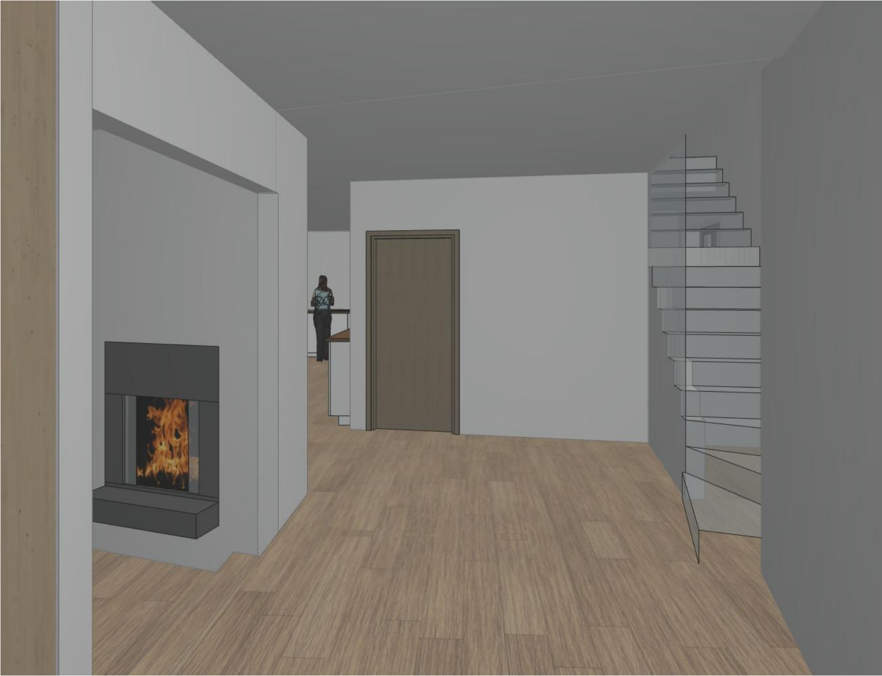
Internal Perspective 1