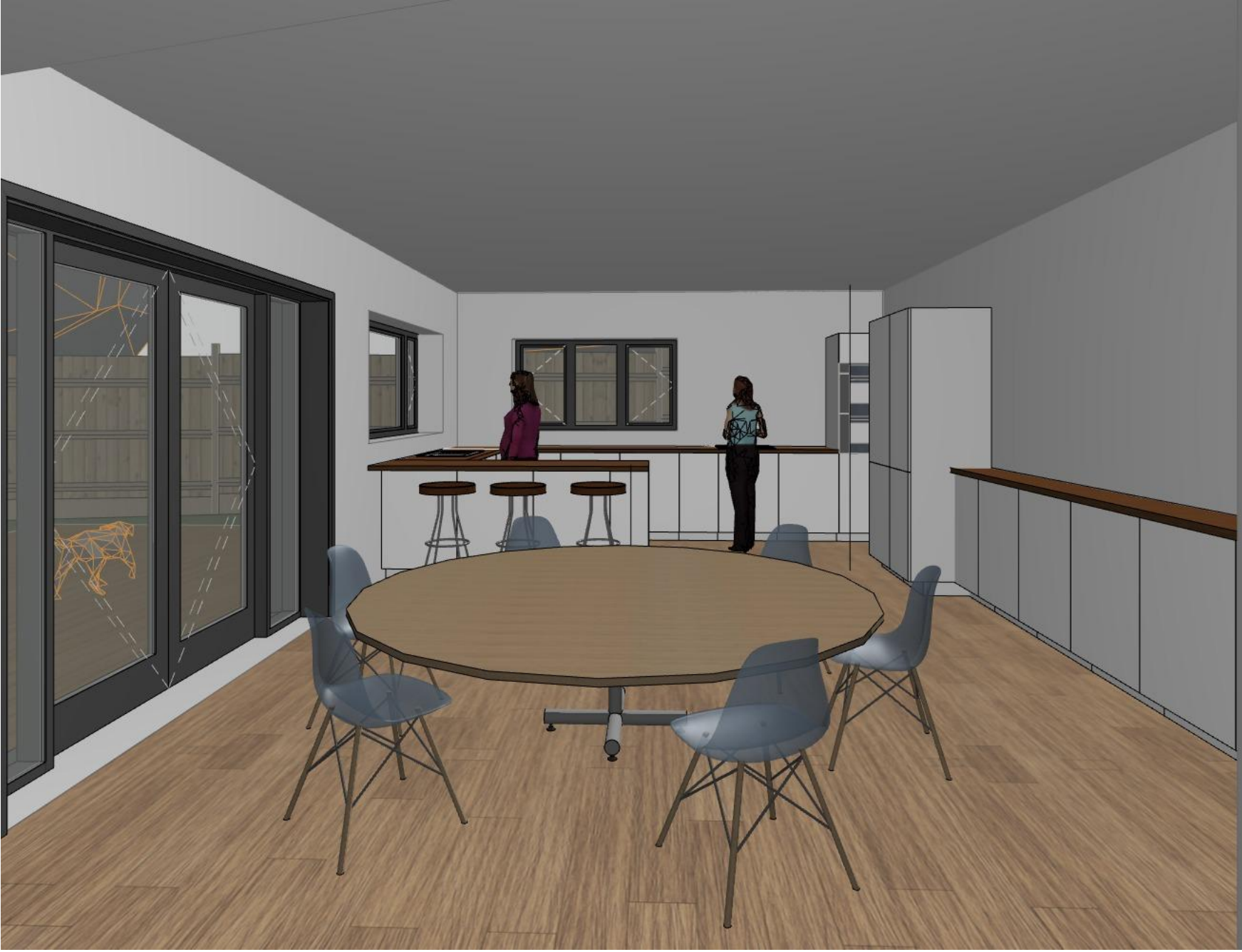
Internal Perspective 3