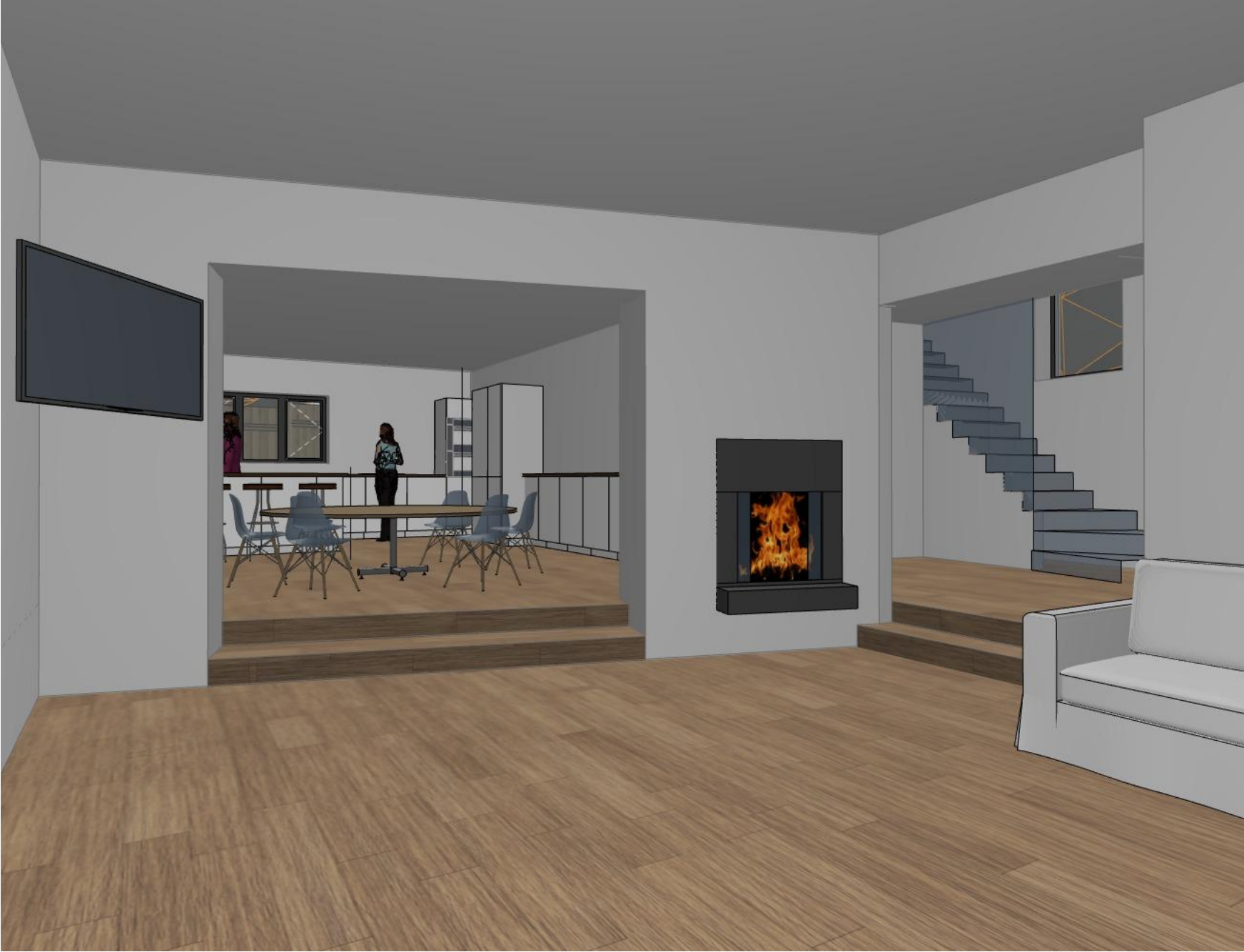
Internal Perspective 2