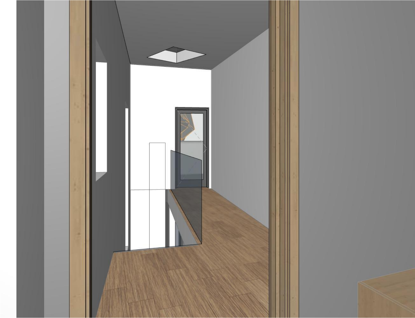
Internal Perspective 4