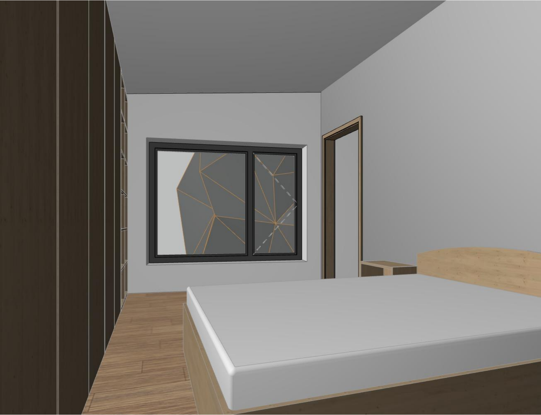
Internal Perspective 7