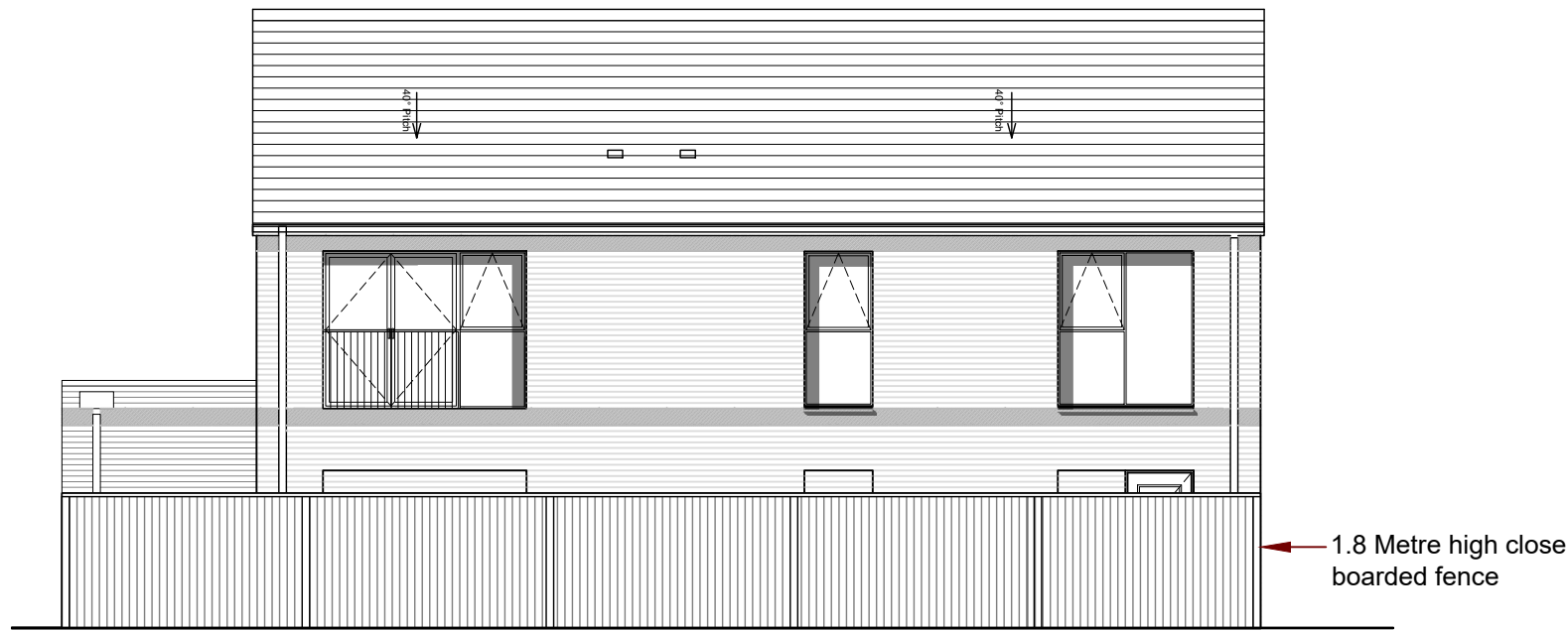
Rear Elevation (South)