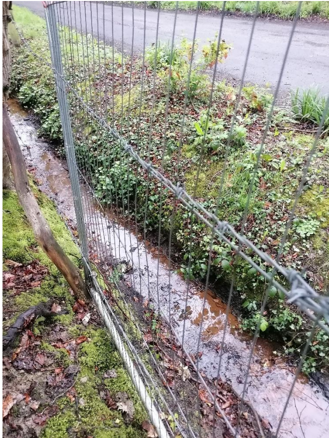
Drainage ditch along Clay Hall Lane