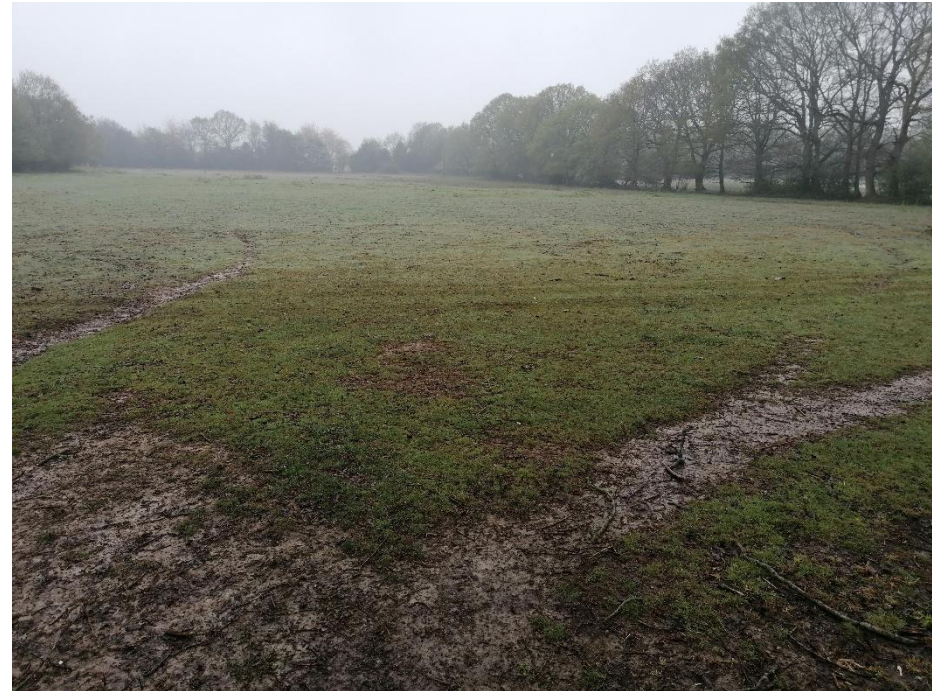
Surface water flow paths at north of the Site