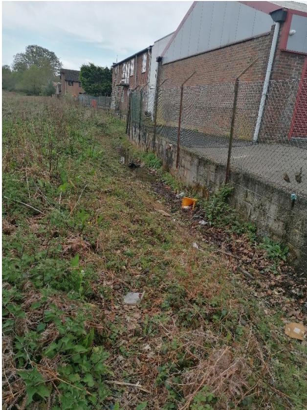
Ditch at south of the Site between the fields and Borers Arm Yard