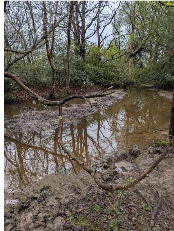
Unnamed watercourse at the northern boundary of the northern land parcel

Project Land North of Borers Arms Road Project No. P25002 Client Fairfax Acquisitions Ltd