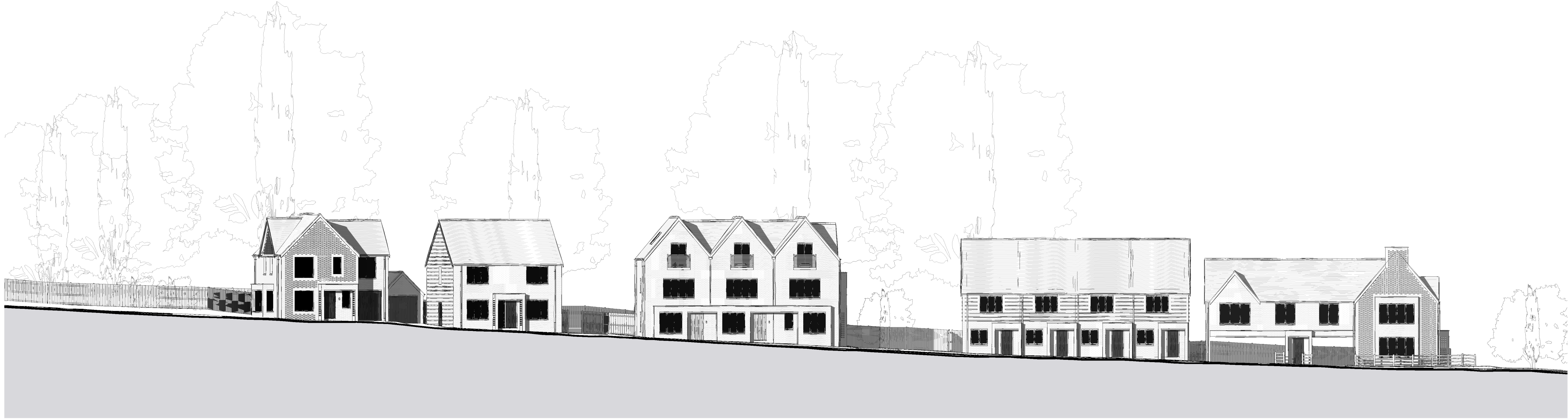
Street Scene BB