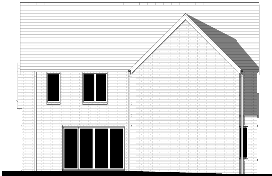
Left Flank Elevation