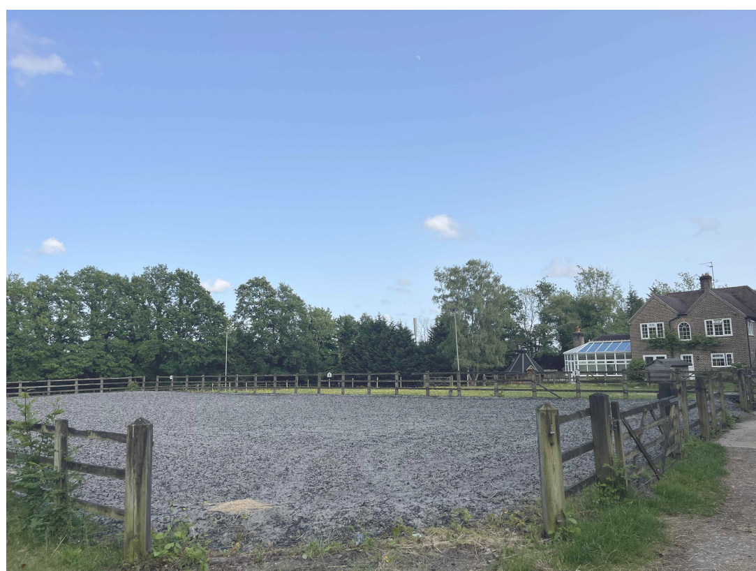
VIEW 3 SOUTH EAST