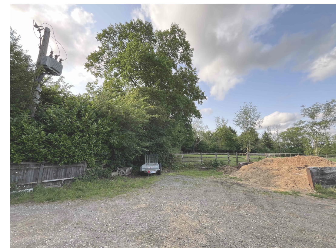
VIEW 1 NORTH FROM NORTHERN CROSSOVER