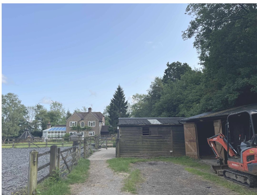
VIEW 4 SOUTH - TOWARDS JEREMY'S COTTAGE