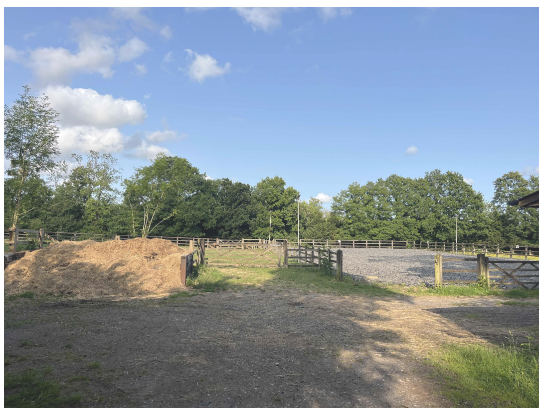
VIEW 2 EAST