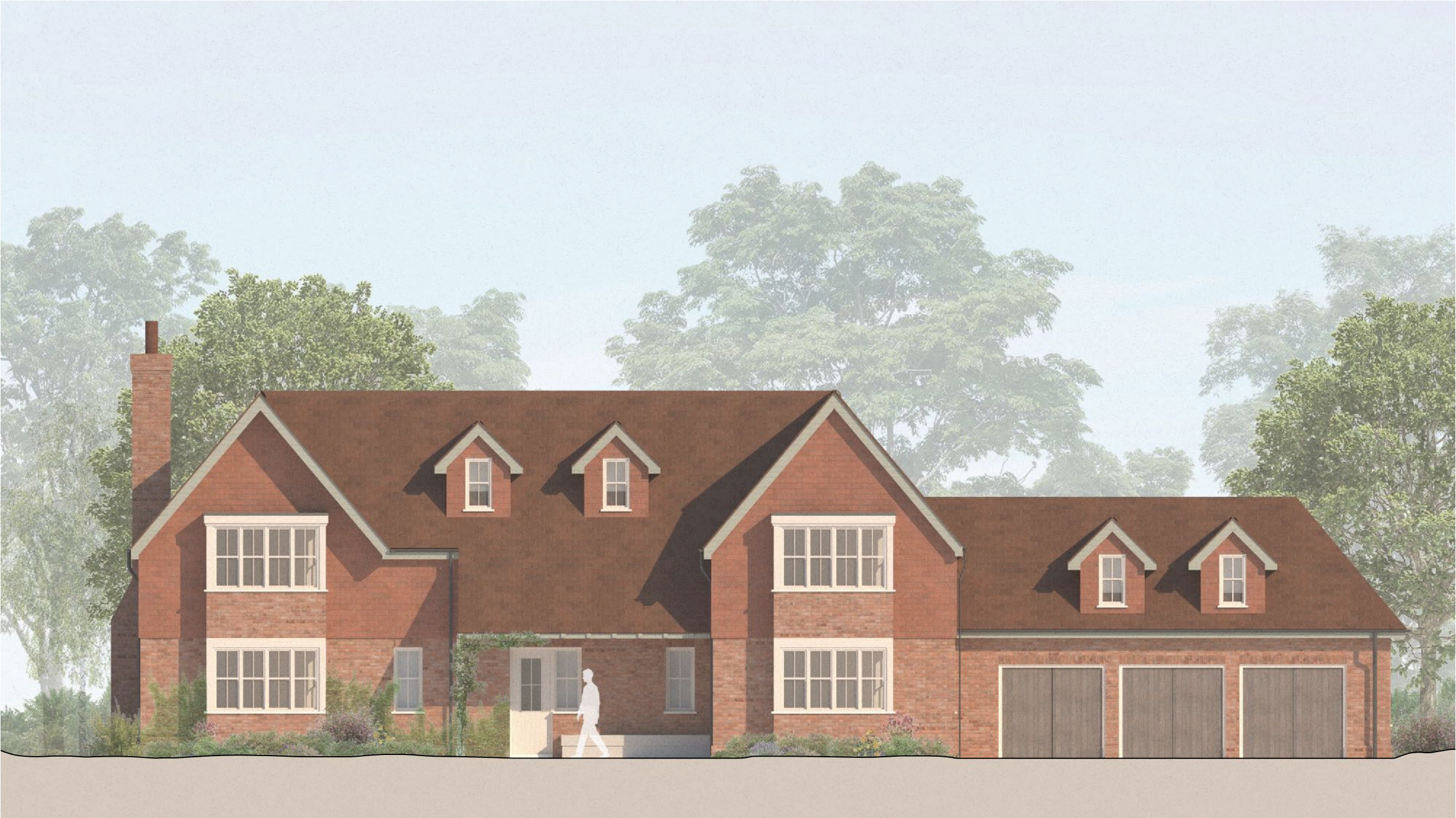
PROPOSED FRONT ELEVATION (WEST)