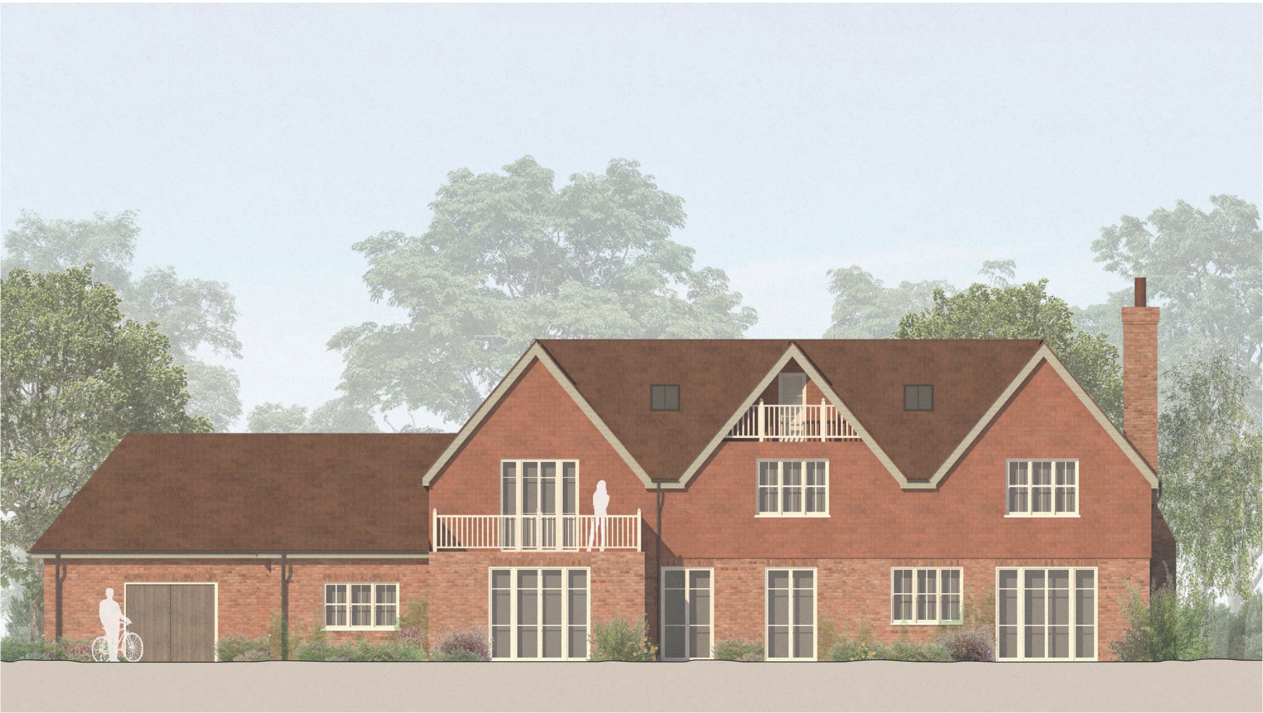
PROPOSED REAR ELEVATION (EAST)

AS PROPOSED RENDERED ELEVATIONS - SCALE 1:100