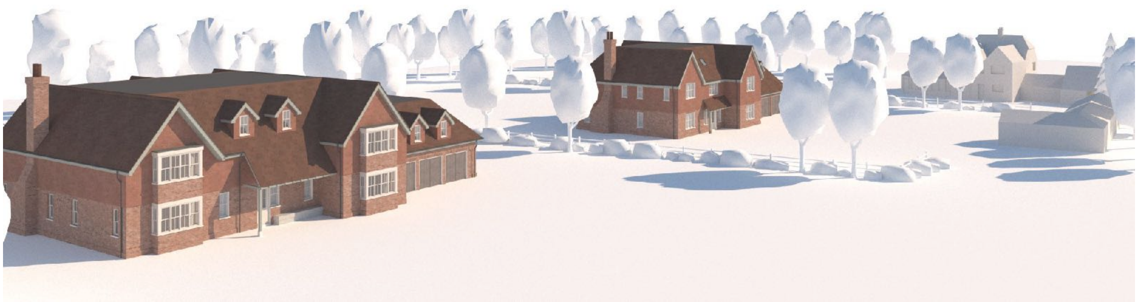
VIEW 1 (FRONT)