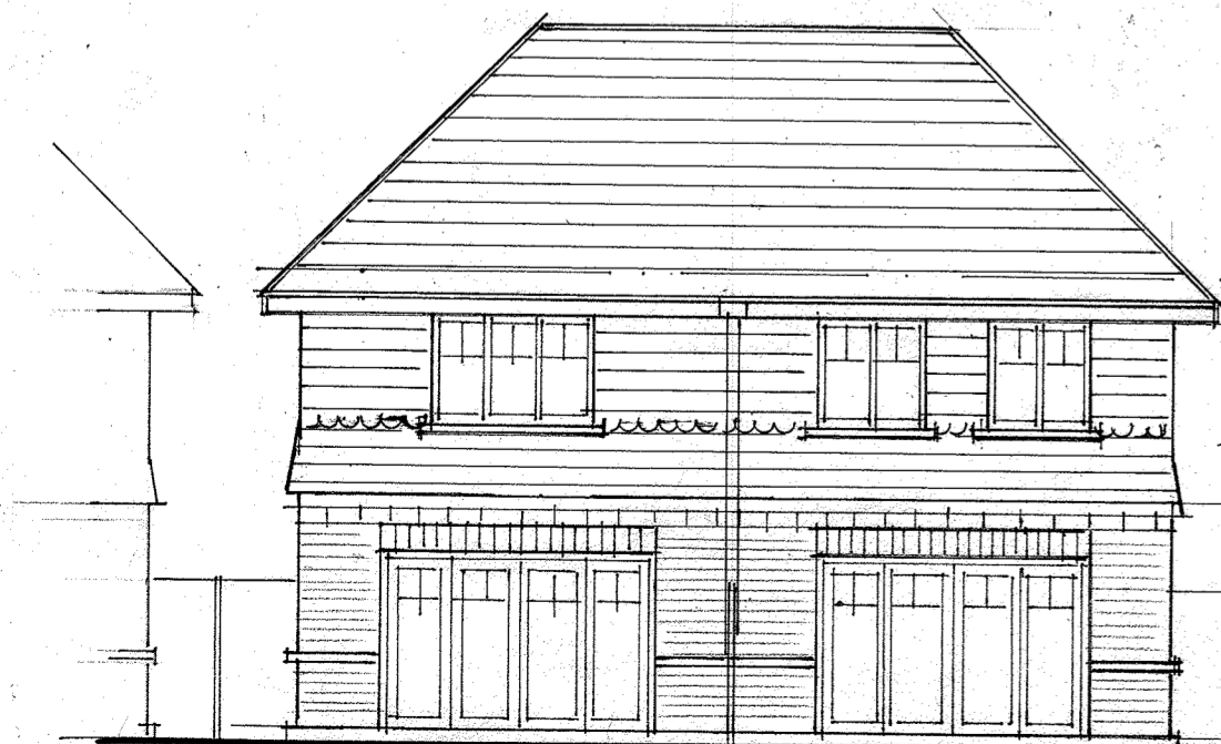
Elevation 3 Plot 5 Plot 6