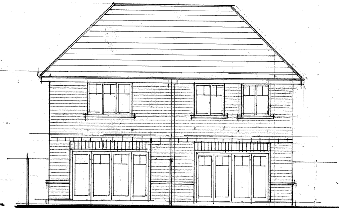
Elevation 3 Plot 7 Plot 8