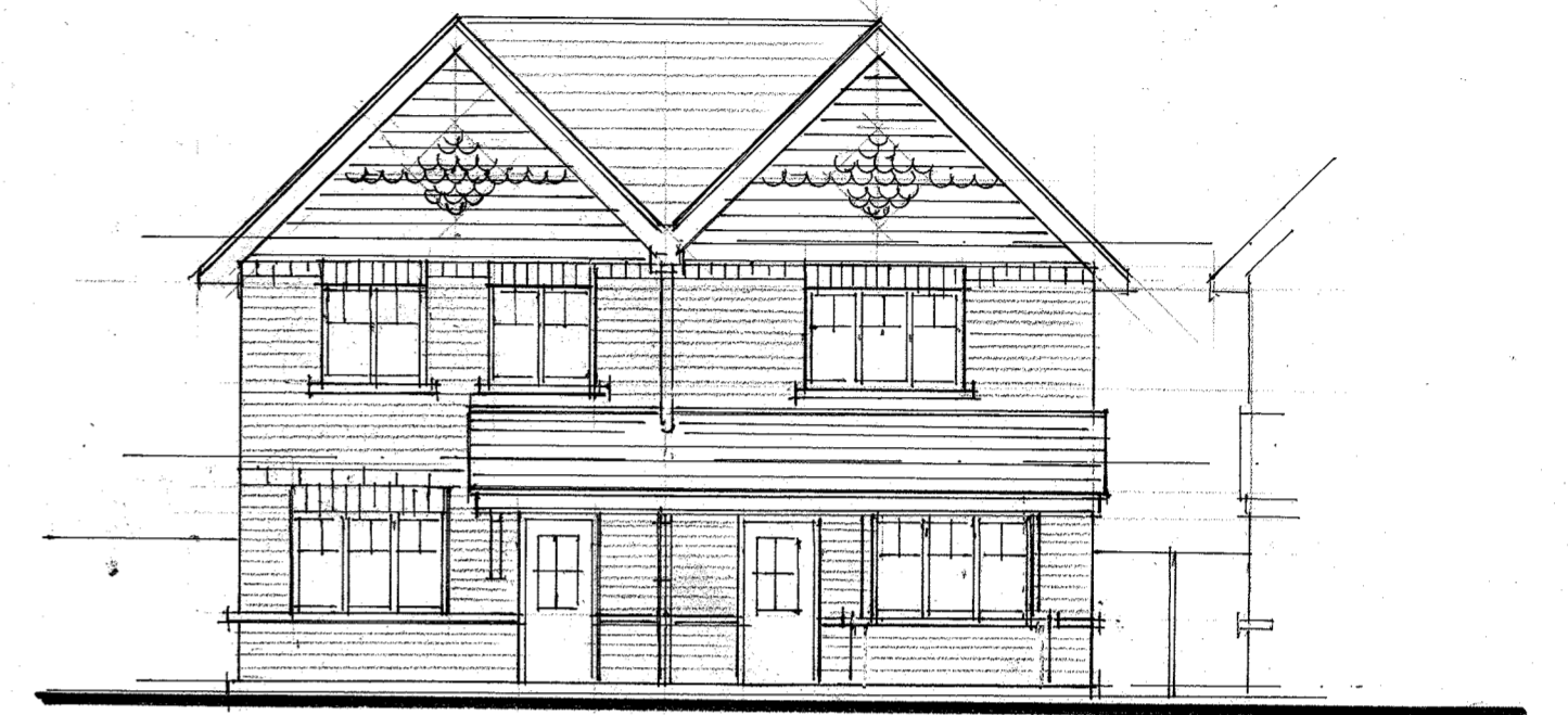
Elevation 1 Plot 8 Plot 7