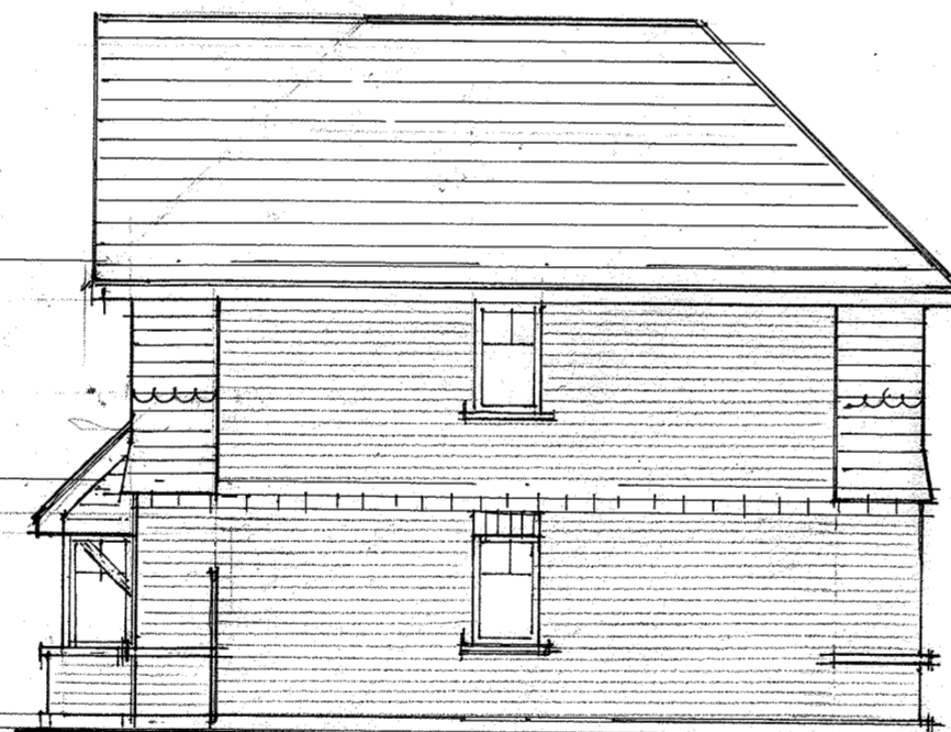
Elevation 4 Plot 5 Plot 6 elevation 2 handed