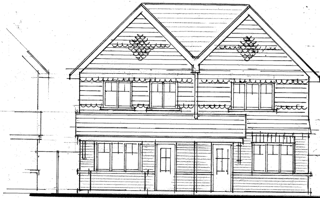
Elevation 1 Plot 6 Plot 5