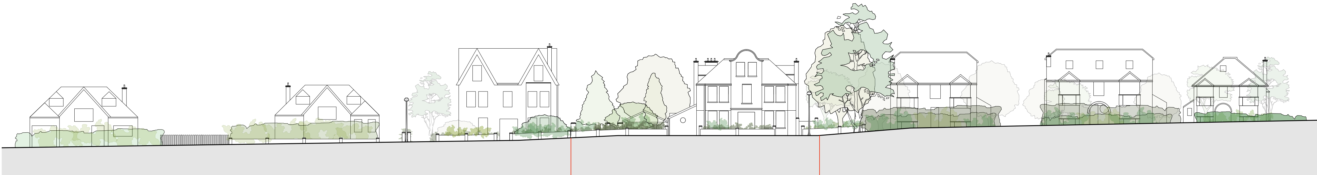
AS EXISTING STREET ELEVATION