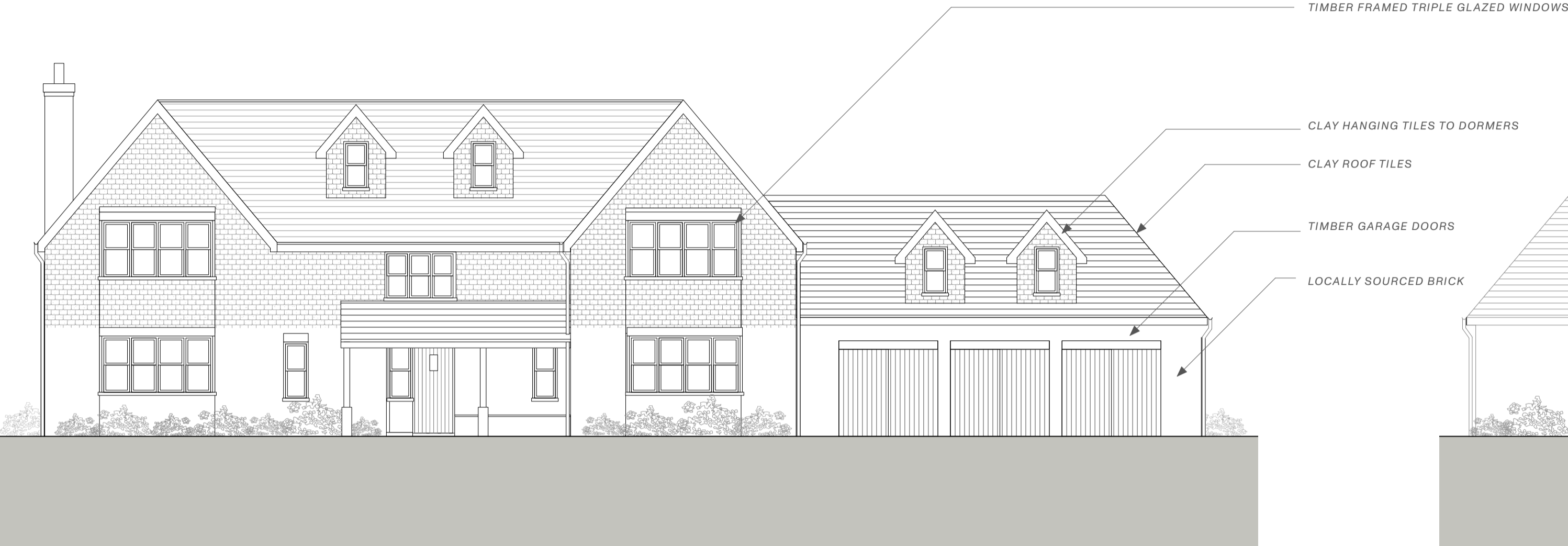
PROPOSED FRONT ELEVATION (WEST)