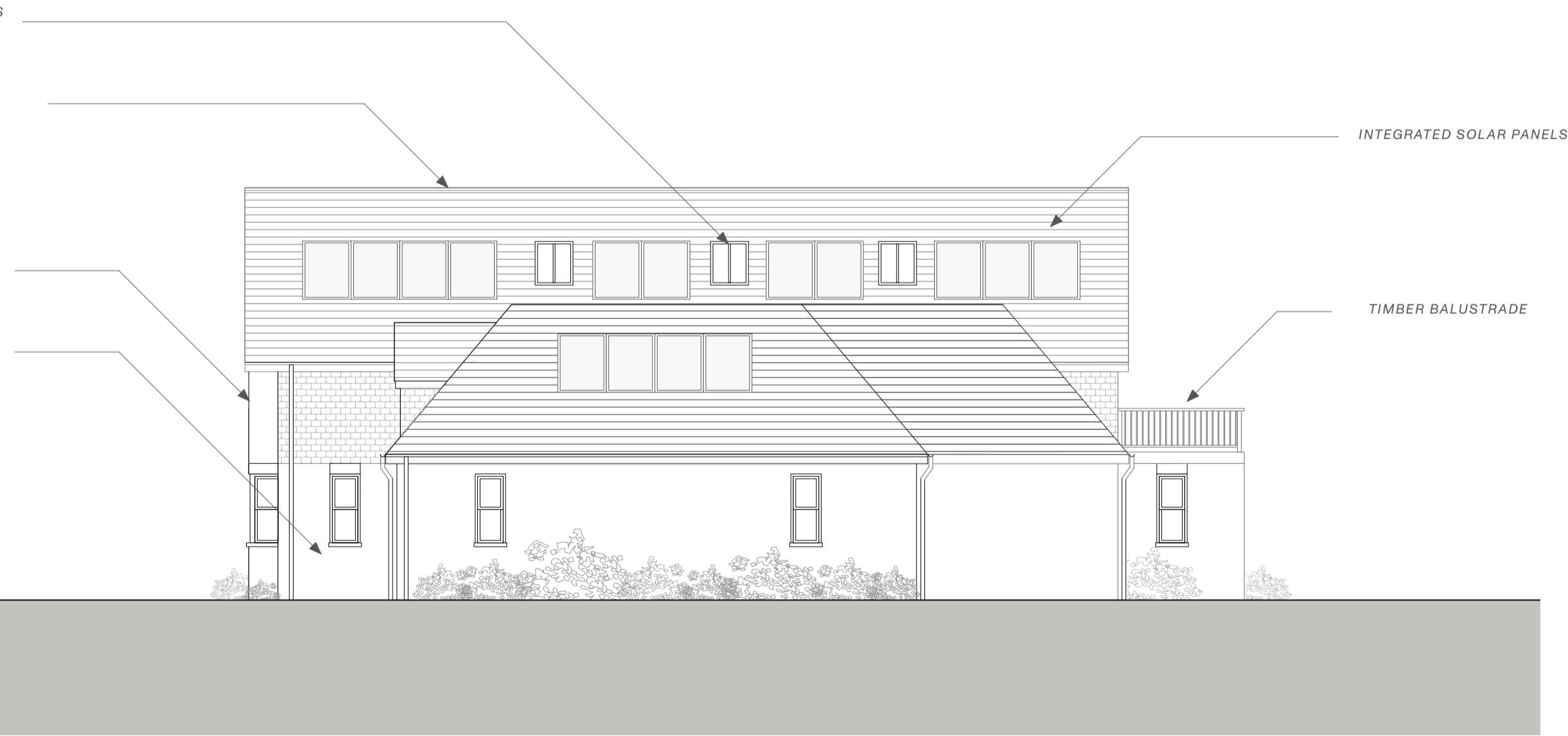
PROPOSED SIDE ELEVATION (SOUTH)