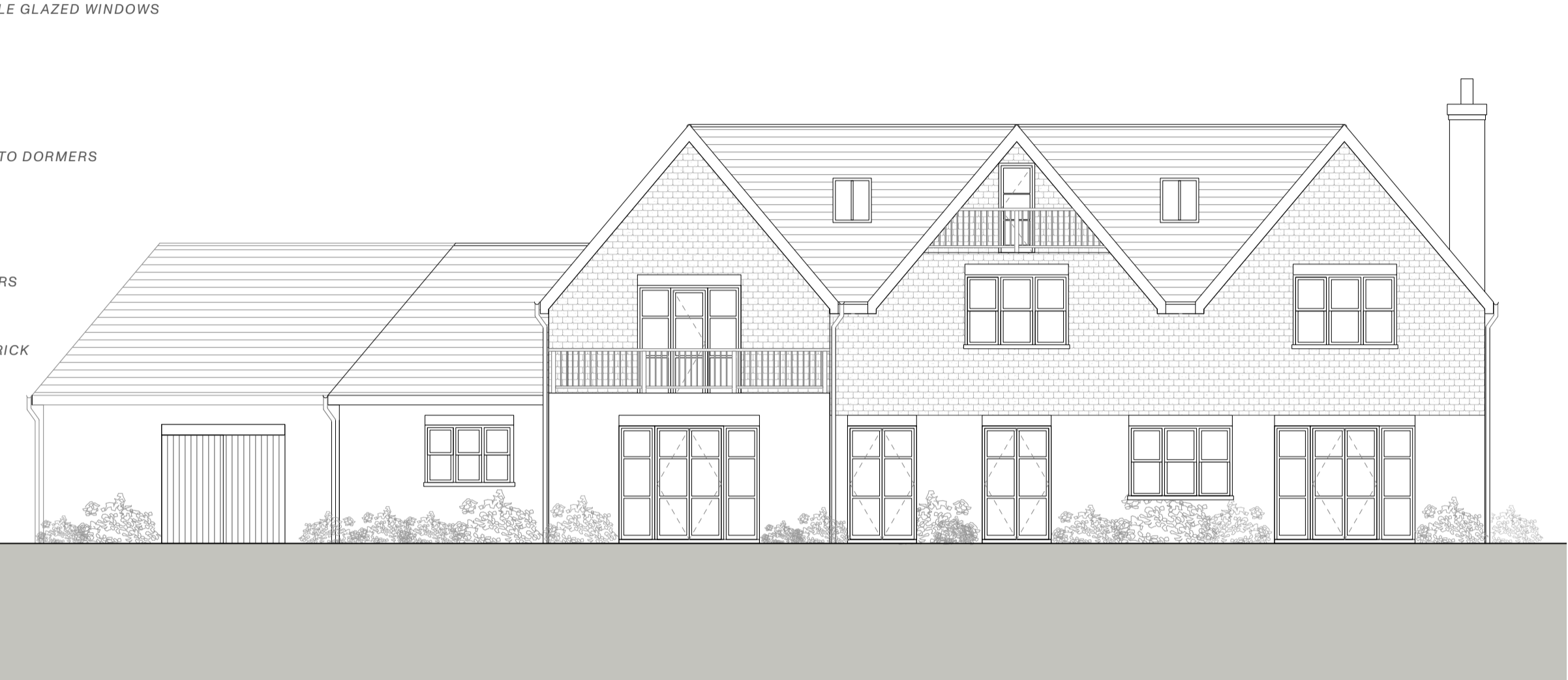
PROPOSED REAR ELEVATION (EAST)