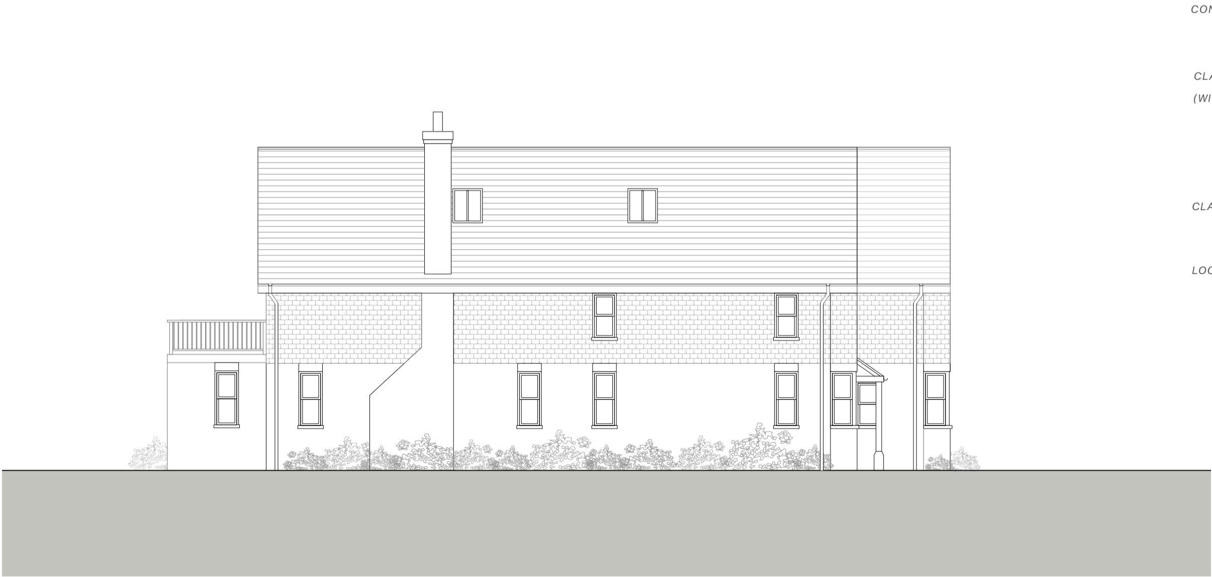
PROPOSED SIDE ELEVATION (NORTH)