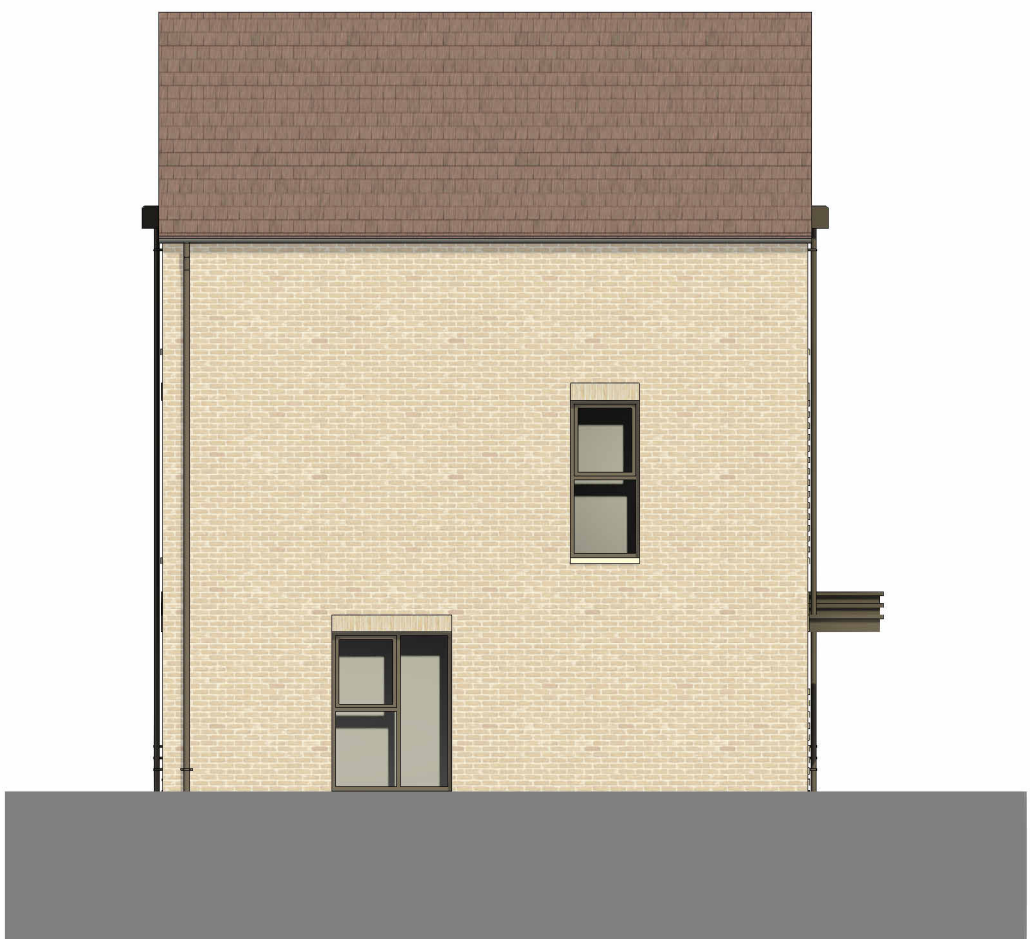
Left Elevation 1 : 100