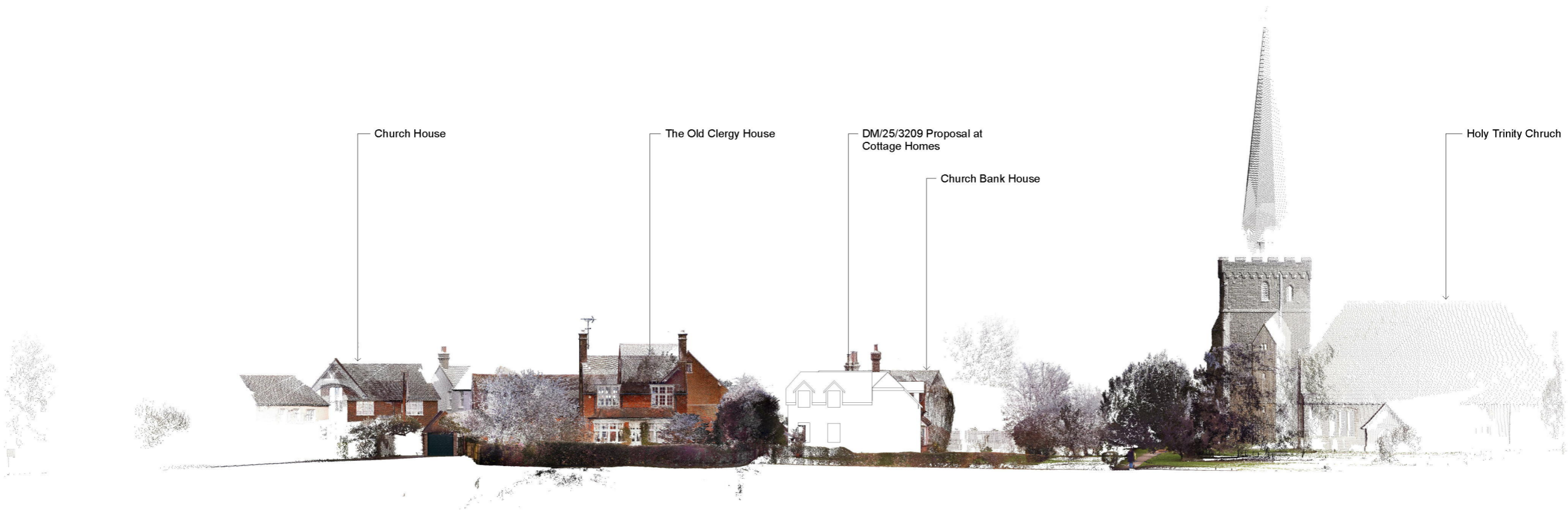
South Elevation 1 : 200

NOTES Do not scale from this drawing. Any discrepancies should be reported immediately. This drawing is copyright. It must not be reproduced or disclosed to third parties without our prior permission. This drawing is to be read in conjunction with all relevant consultants, specialist manufacturers drawings and specifications. Any surveyed information incorporated within this drawing cannot be guaranteed as accurate unless confirmed by fixed dimension. All dimensions are in millimetres unless noted otherwise.