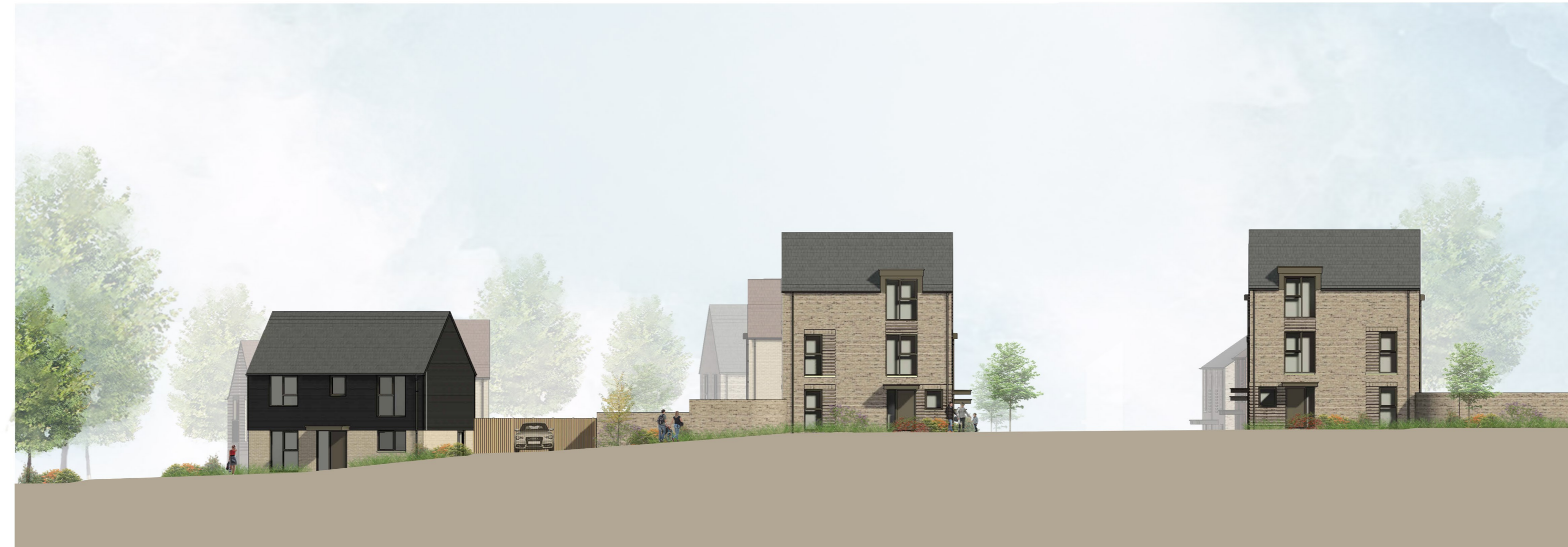
Street Elevation O

Notes Do not scale from this drawing. All contractors must visit the site and be responsible for taking and checking dimensions. All construction information should be taken from figured dimensions only. Any discrepancies between drawings, specifications and site conditions must be brought to the attention of the supervising officer. This drawing & the works depicted are the copyright of JTP. This drawing is prepared for the specific project stage in the Drawing Status section below and is not intended to be used for any other purpose. Whilst all reasonable efforts are used to ensure drawings are accurate, JTP accepts no liability for any reliance placed on, or use made of, this plan for anyone for purposes other than those stated in the Drawing Status below.