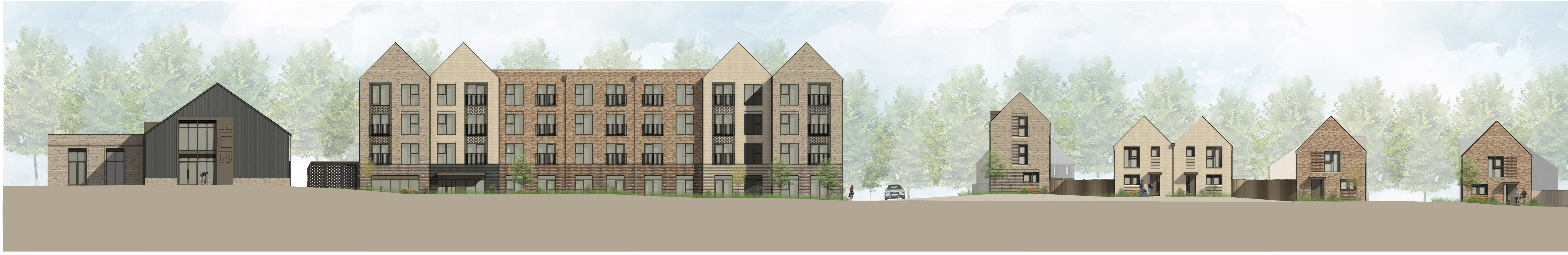
Street Elevation L