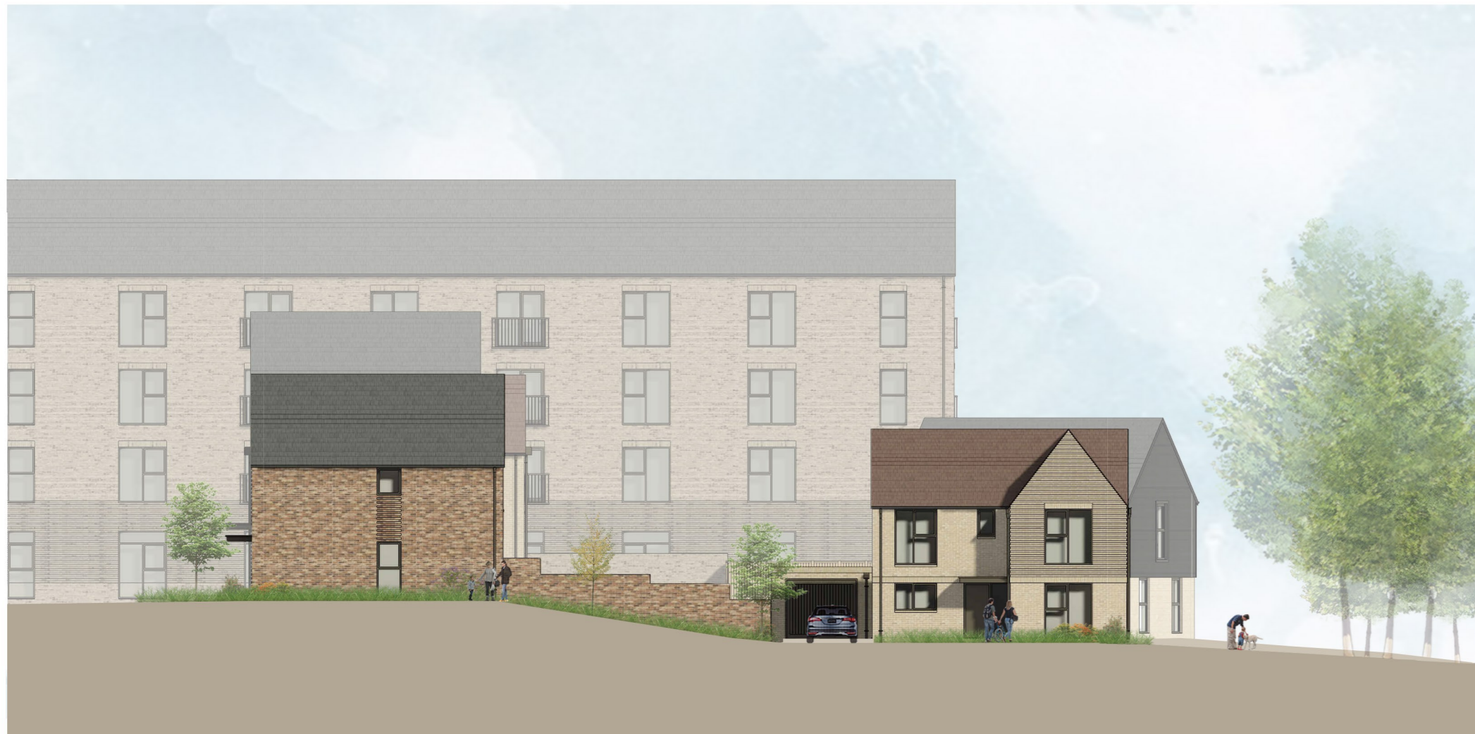
Street Elevation N