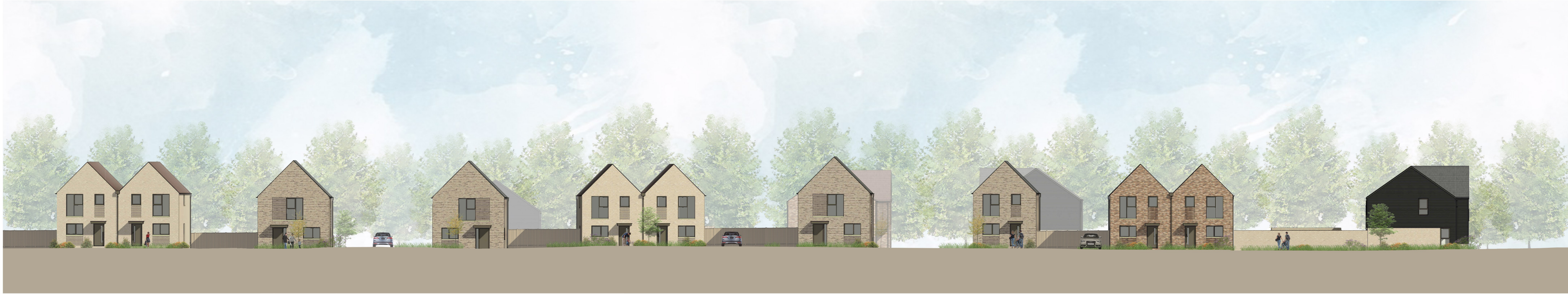
Street Elevation L continued