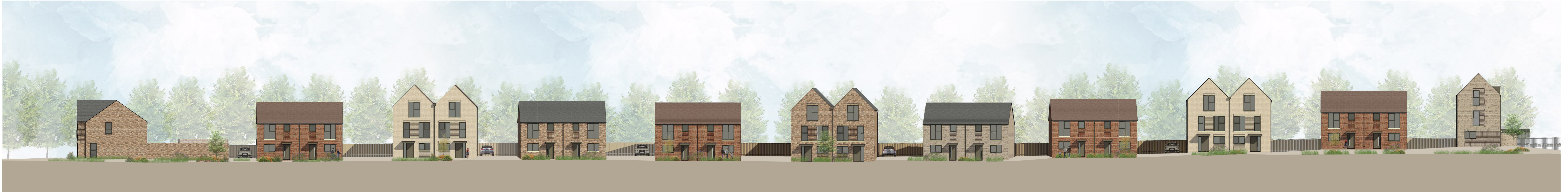
Street Elevation M