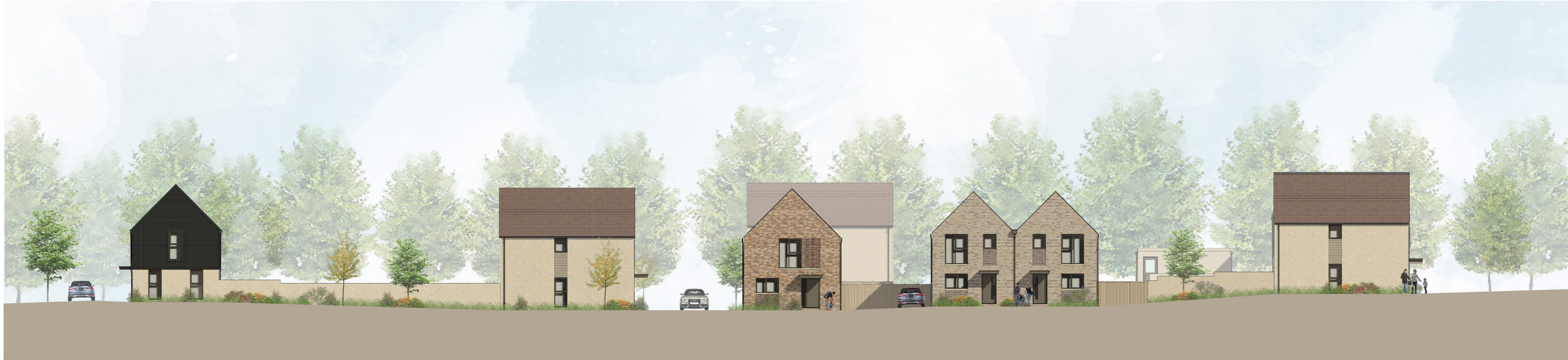
Street Elevation V