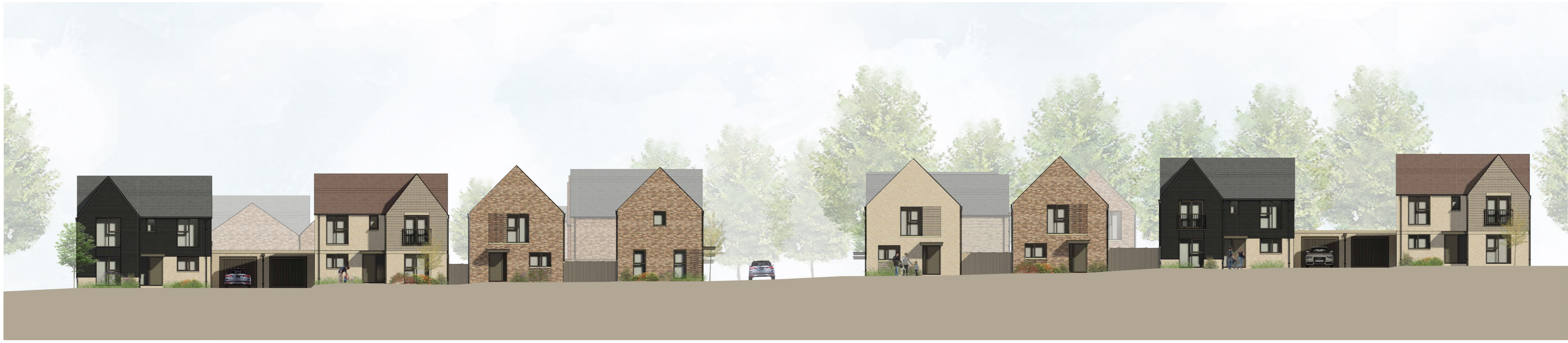
Street Elevation U