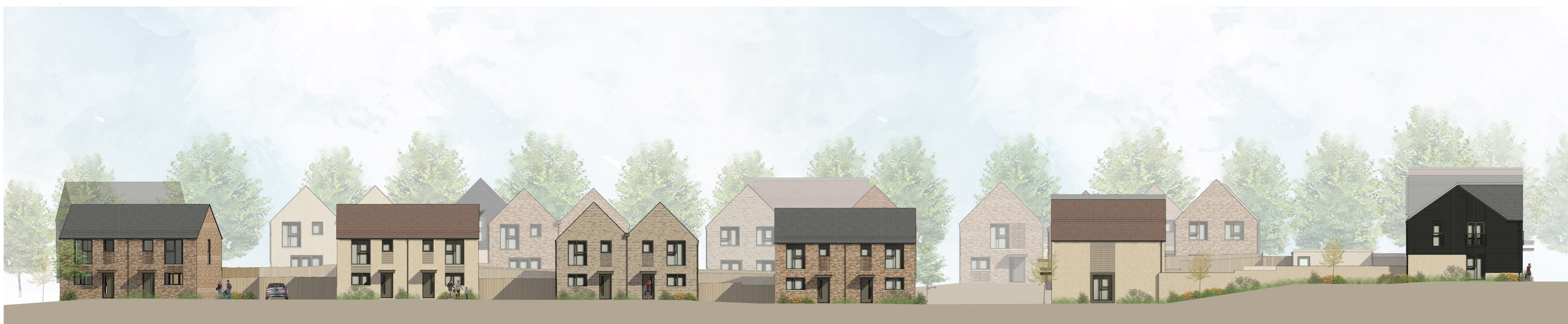
Street Elevation Y

Notes Do not scale from this drawing. All contractors must visit the site and be responsible for taking and checking dimensions. All construction information should be taken from figured dimensions only. Any discrepancies between drawings, specifications and site conditions must be brought to the attention of the supervising officer. This drawing & the works depicted are the copyright of JTP. This drawing is prepared for the specific project stage in the Drawing Status section below and is not intended to be used for any other purpose. Whilst all reasonable efforts are used to ensure drawings are accurate, JTP accepts no liability for any reliance placed on, or use made of, this plan by anyone for purposes other than those stated in the Drawing Status below.