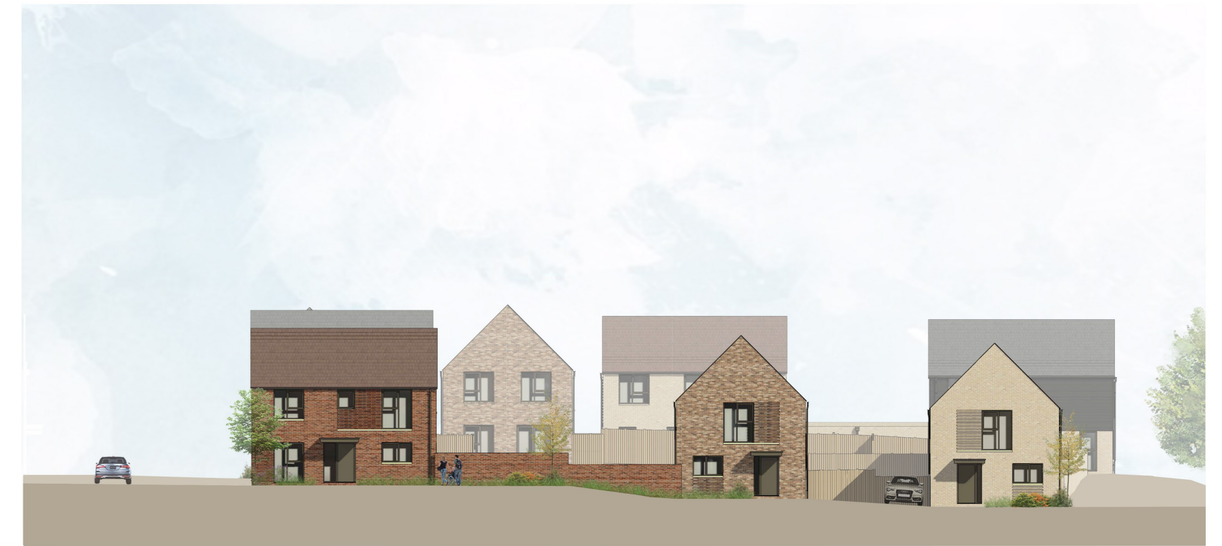
Street Elevation X