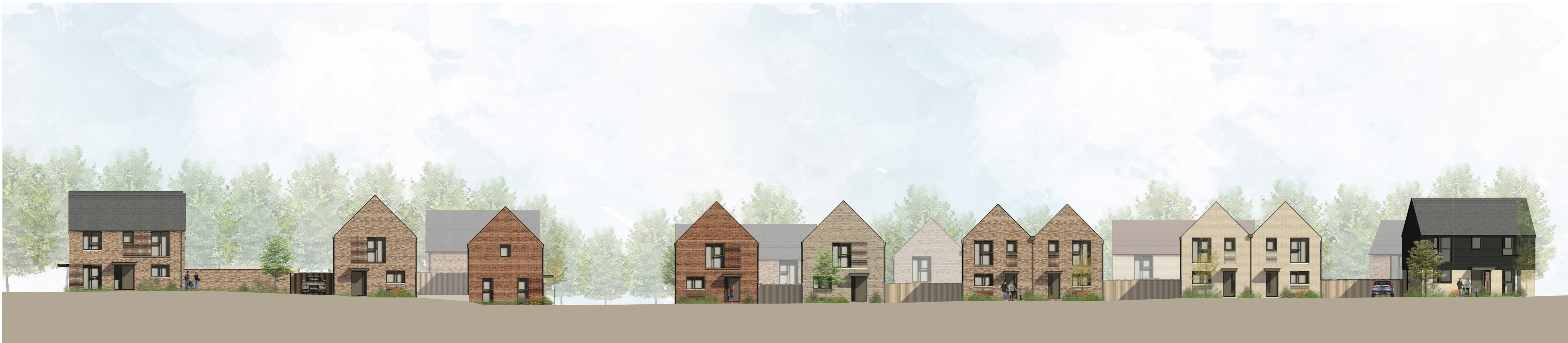
Street Elevation W