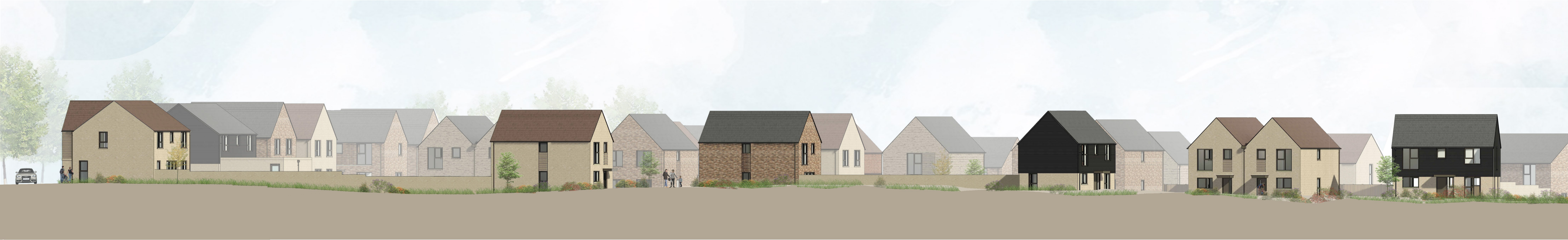
Isaac's Lane Street Elevation - Southern Parcel 1.8b

P1 12.01.26 New drawing added to the drawing set following urban design comments AN ABL