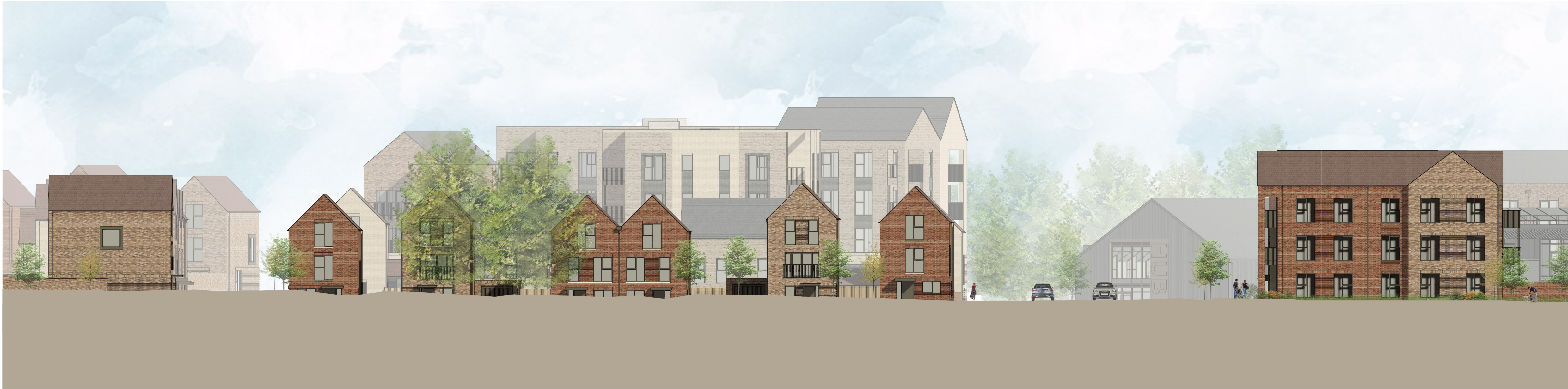
Isaac's Lane Street Elevation - Site Entrance

Notes Do not scale from this drawing. All contractors must visit the site and be responsible for taking and checking dimensions. All construction information should be taken from figured dimensions only. Any discrepancies between drawings, specifications and site conditions must be brought to the attention of the supervising officer. This drawing & the works depicted are the copyright of JTP. This drawing is prepared for the specific project stage in the Drawing Status section below and it is not intended to be used for any other purpose. Whilst all reasonable efforts are used to ensure drawings are accurate, JTP accept no liability for any reliance placed on, or use made of, this plan by anyone for purposes other than those stated in the Drawing Status below.