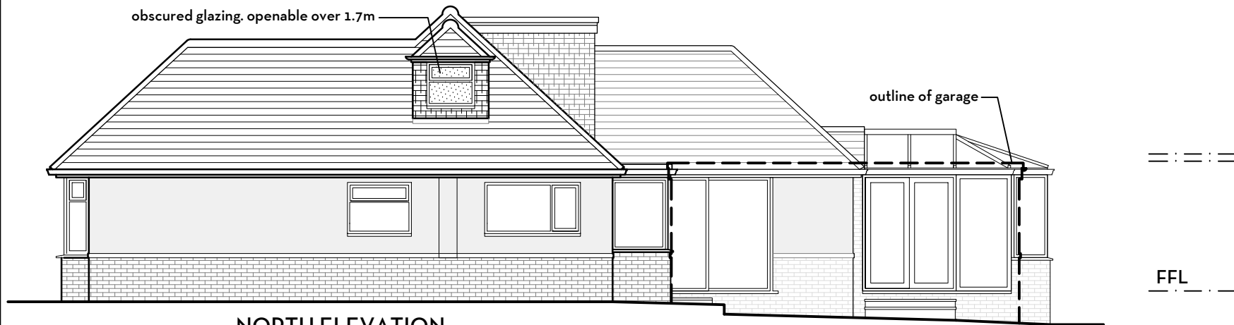
NORTH ELEVATION (garage omitted for clarity)