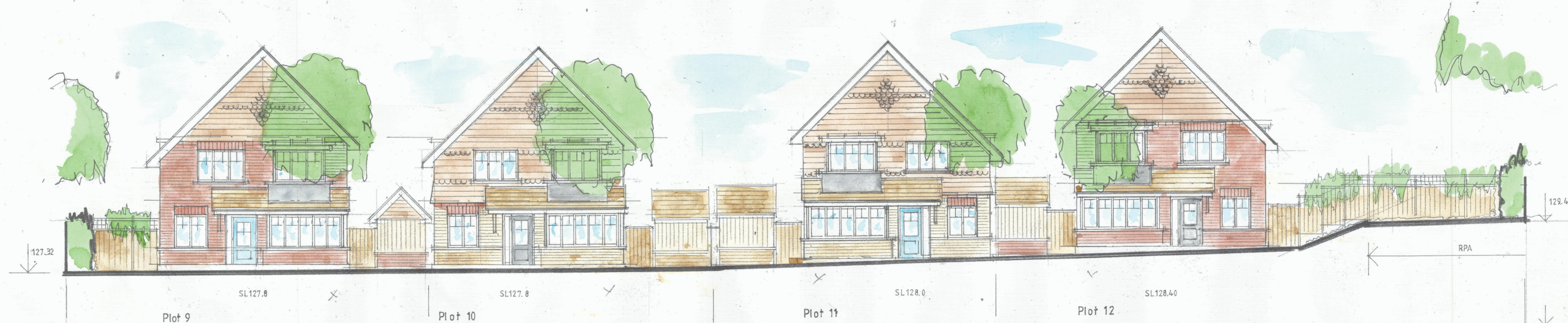
Elevation to south from access road