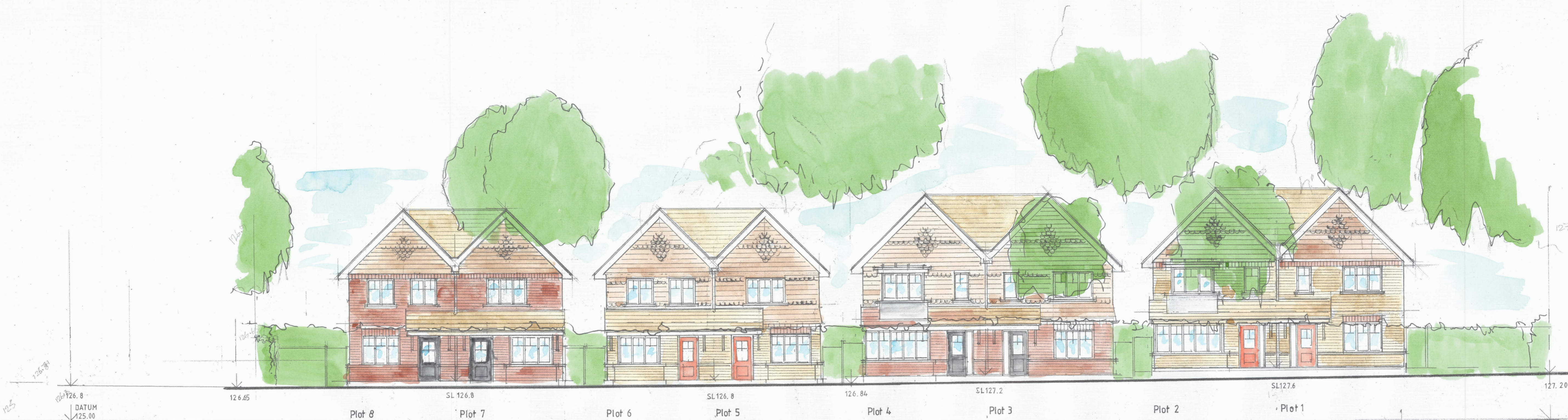
Elevation to Hammerwood Road