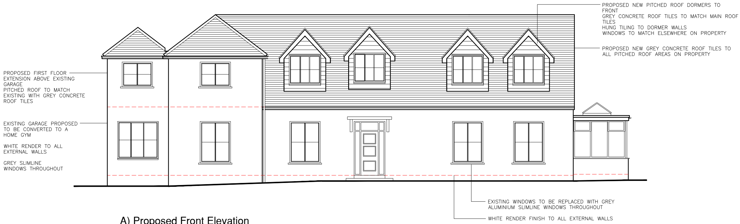
A) Proposed Front Elevation