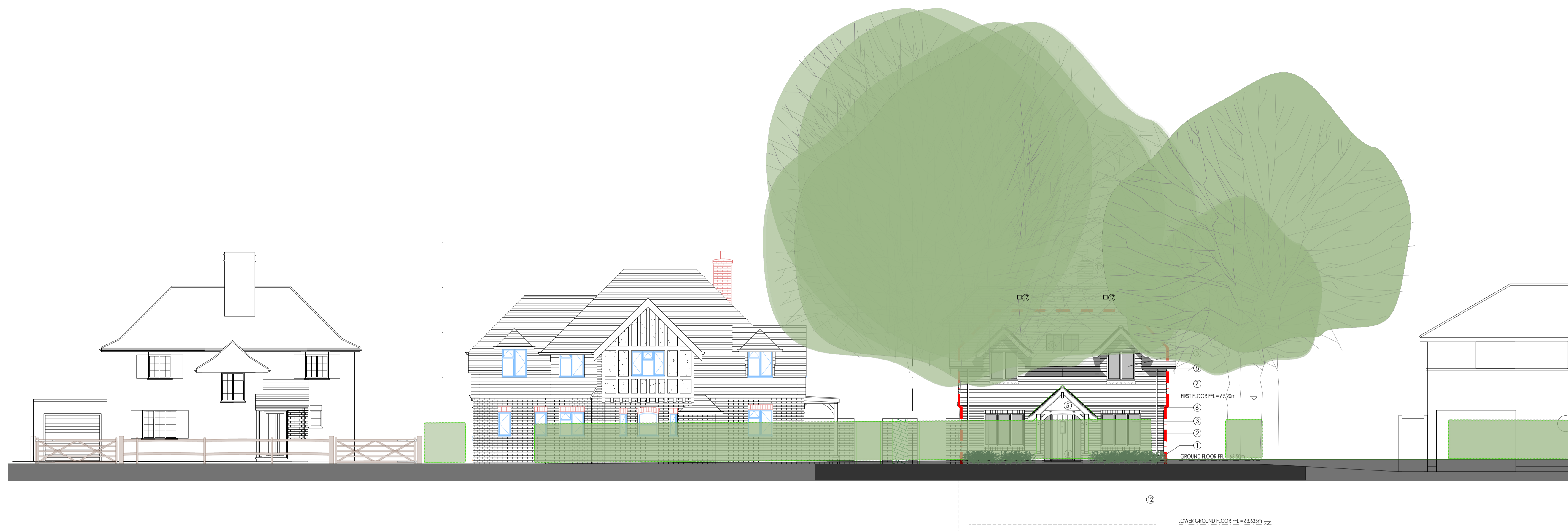
STREET SCENE ELEVATION - AS PROPOSED SCALE @ 1:100 ON AN A1 SHEET