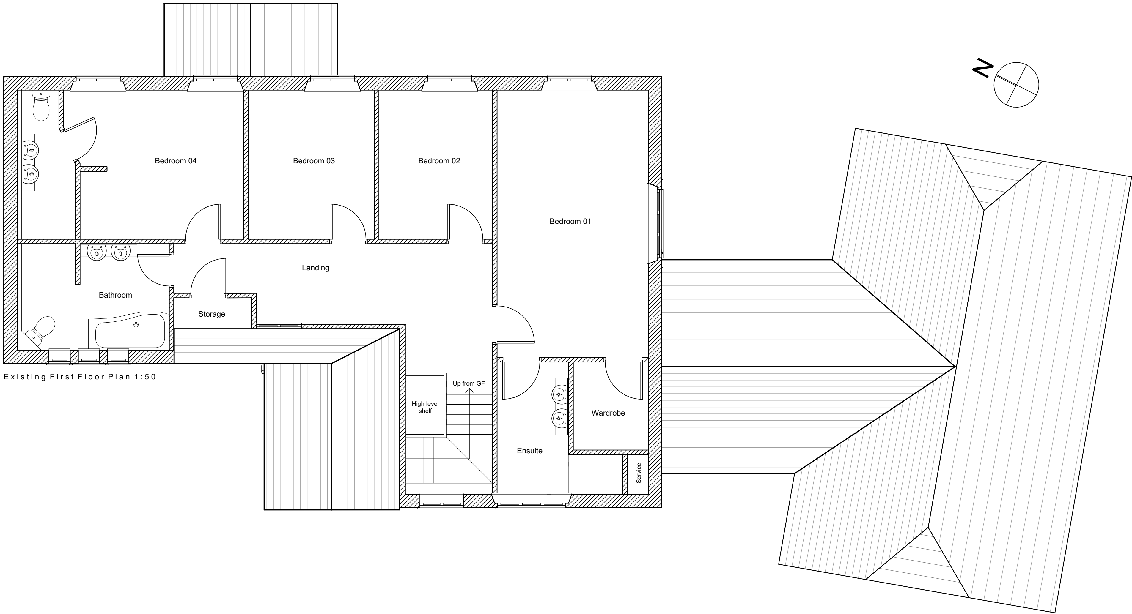
Existing First Floor Plan 1:50