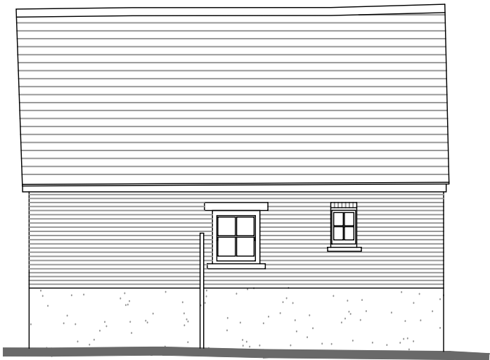
side elevation east