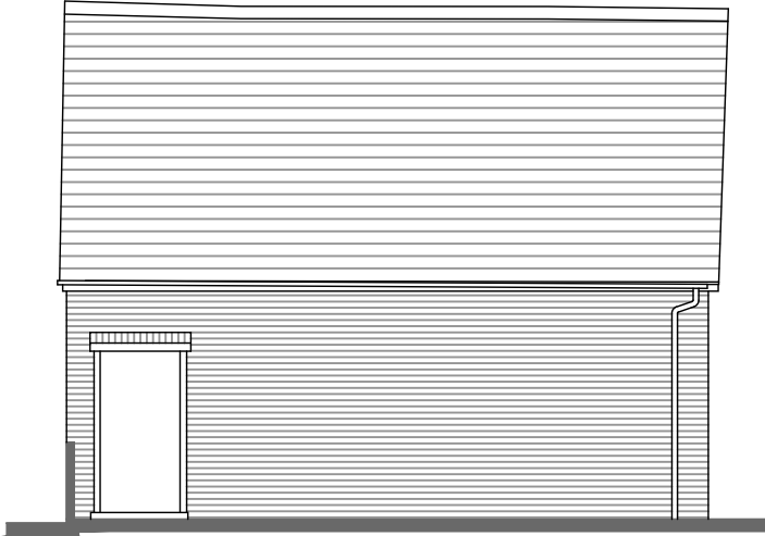
side elevation west