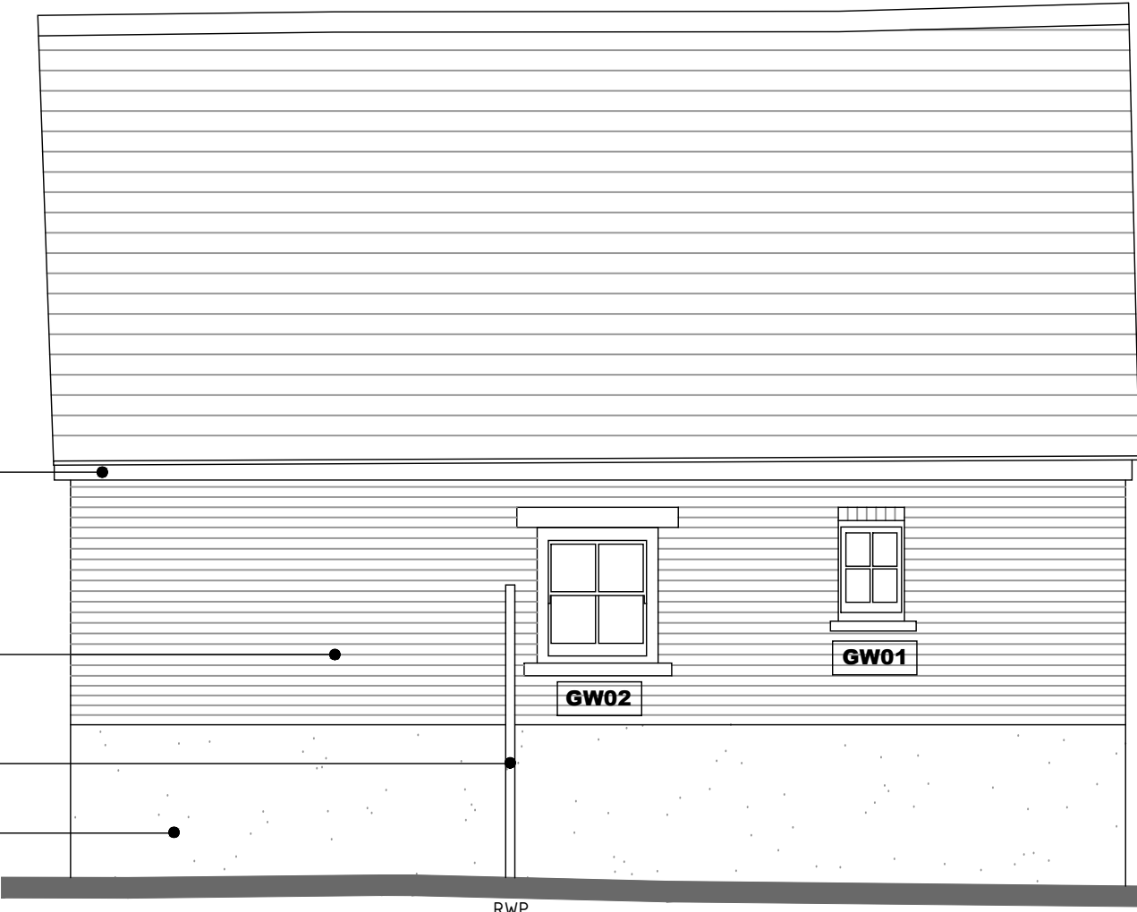
side elevation east

Windows GW01 Garage Timber casement, requires localised repair work + decoration GW02 Garage Timber sash, requires localised repair work + decoration