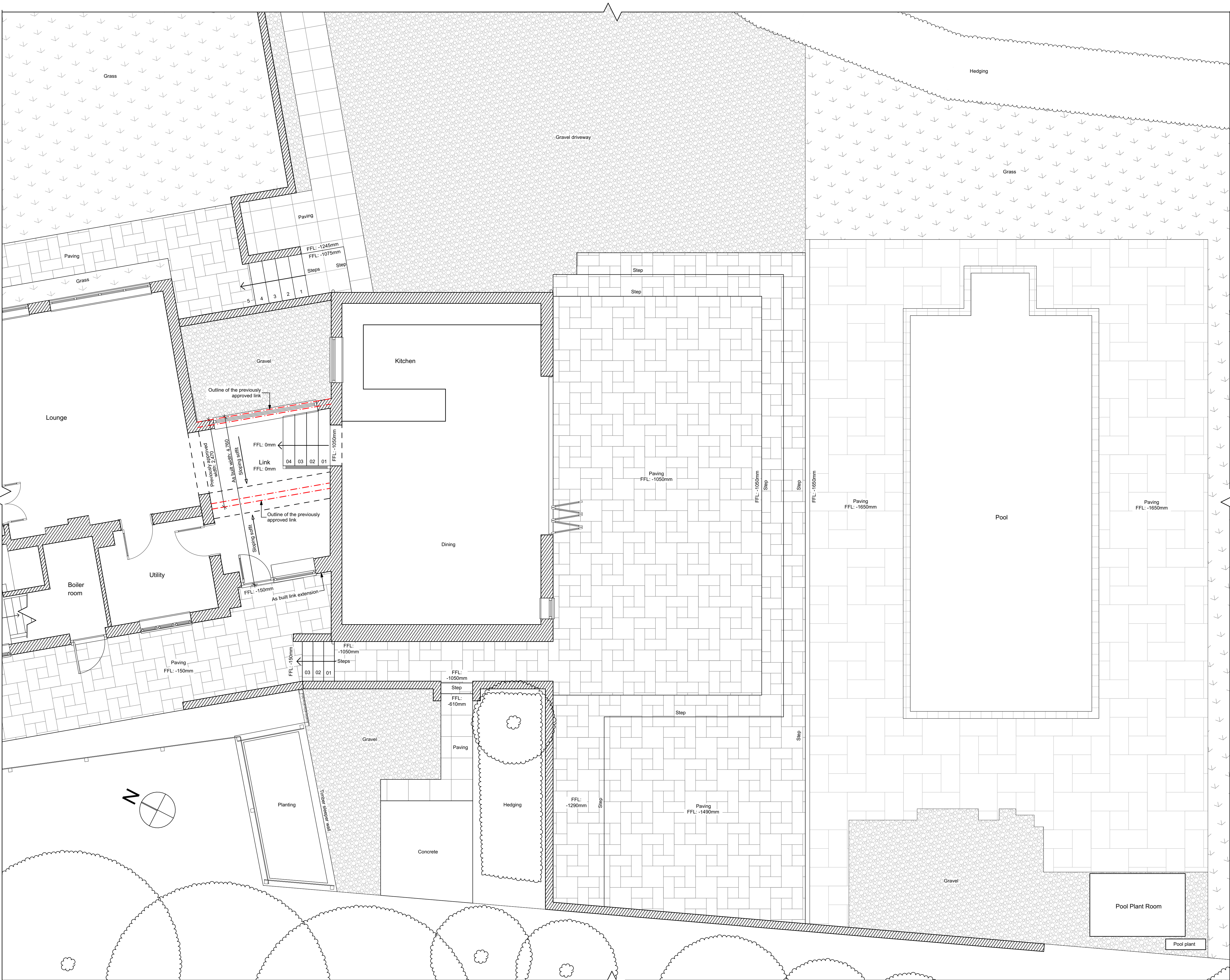
Existing Ground Floor Plan 1:50

Contractor must verify all dimensions on site before commencing any work or shop drawings. If this drawing exceeds the quantities taken in any way, the building designers are to be informed before the work is initiated. Only figured dimensions to be taken from this drawing. Do not scale off this drawing. Drawing based on Ordnance Survey and/or existing record drawings - design and drawing content subject to Site Survey, Structural Survey, Site Investigations, Planning and Statutory Requirements and Approvals. All drainage layouts are schematic and invert levels must be established prior to construction.