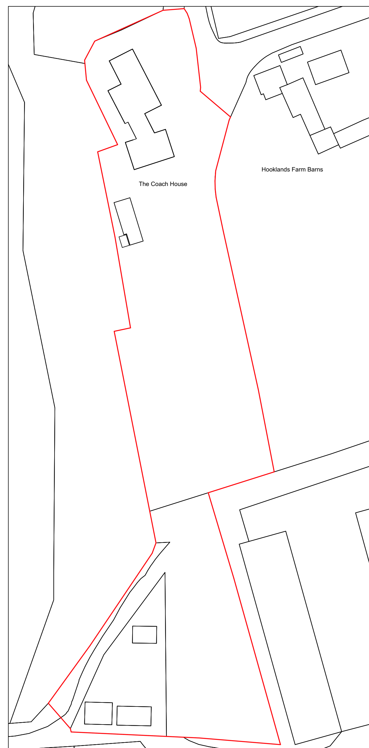
Proposed Site Block Plan 1:500

Contractor must verify all dimensions on site before commencing any work or shop drawings. If this drawing exceeds the quantities taken in any way, the building designers are to be informed before the work is initiated. Only figured dimensions to be taken from this drawing. Do not scale off this drawing. Drawing based on Ordnance Survey and/or existing record drawings - design and drawing content subject to Site Survey, Structural Survey, Site Investigations, Planning and Statutory Requirements and Approvals. All drainage layouts are schematic and invert levels must be established prior to construction.