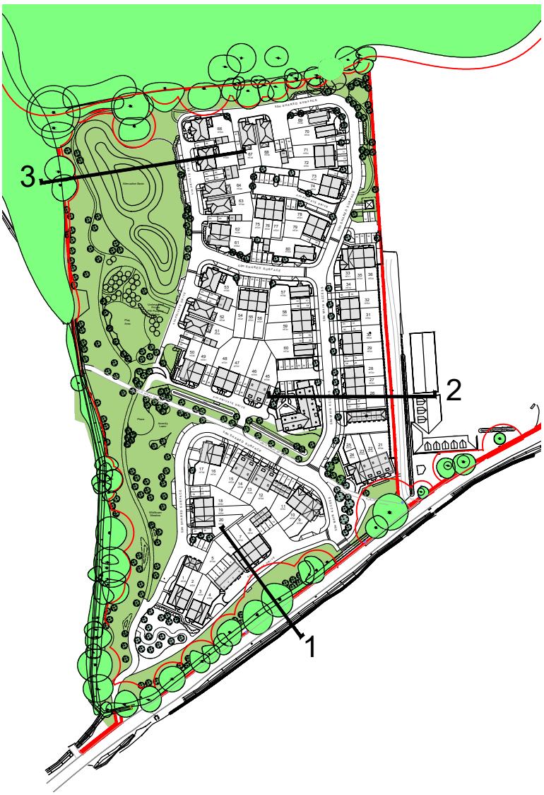
Site Section Key NOT TO SCALE