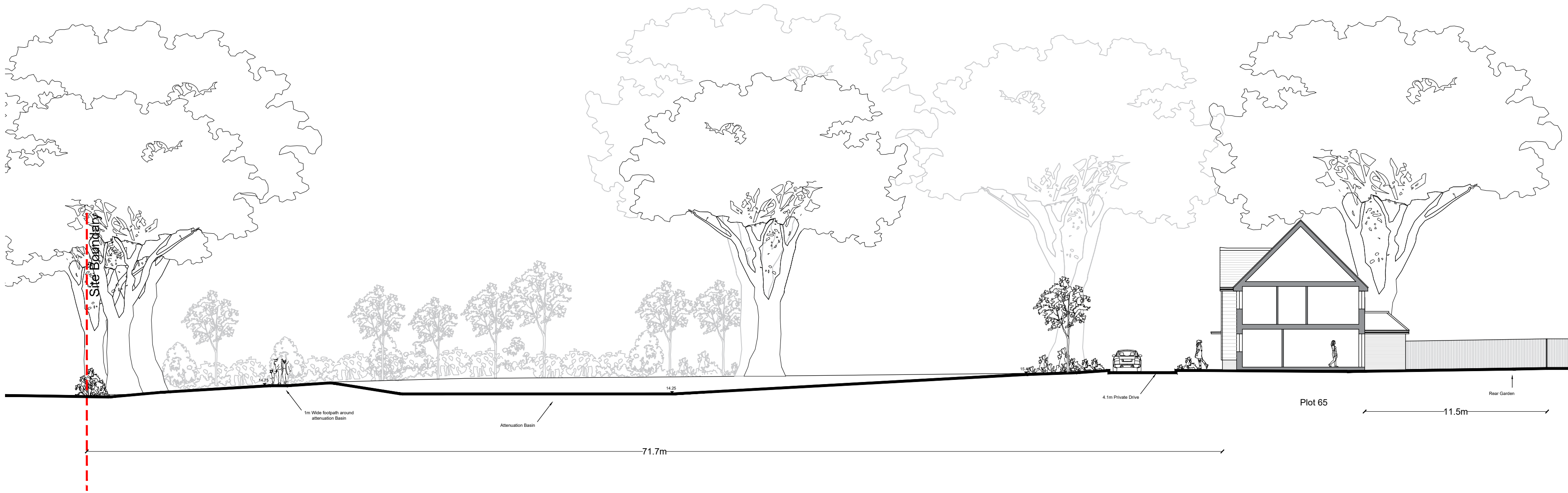
Site Section 3