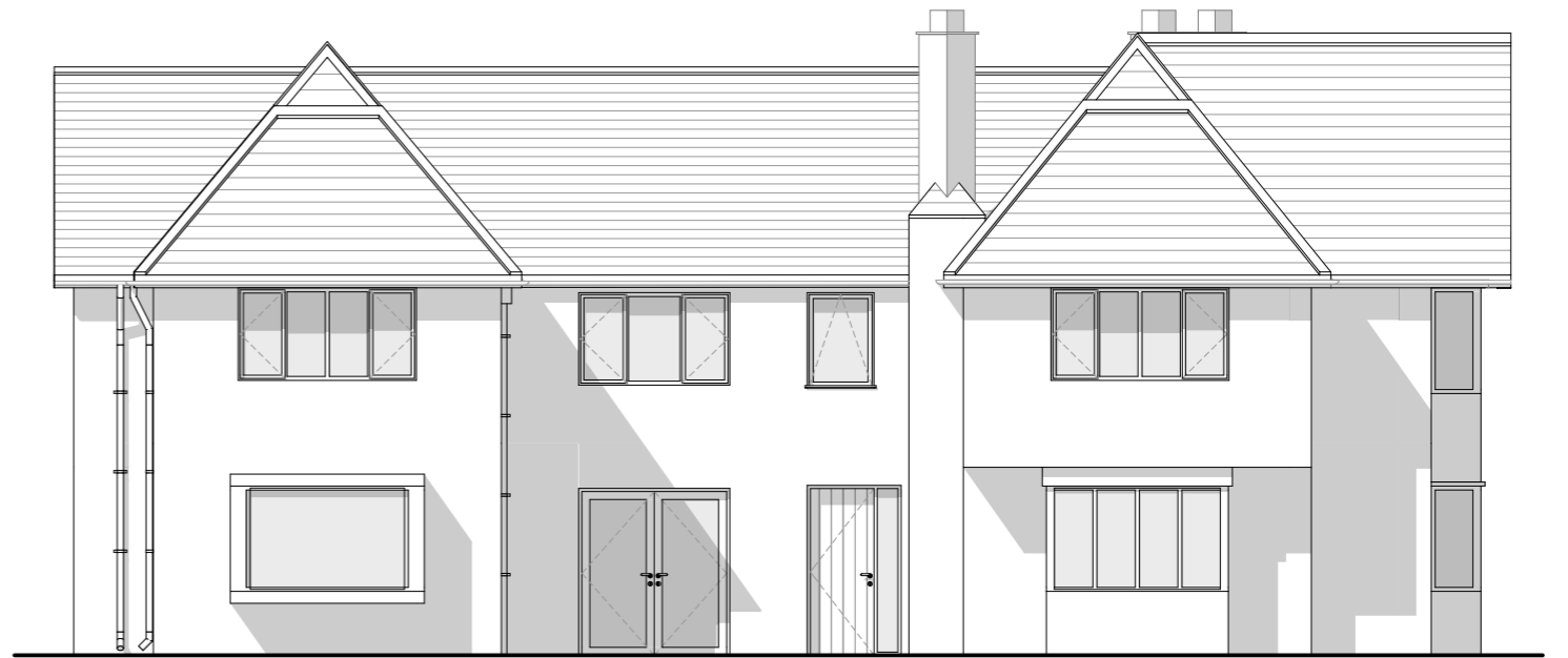
Proposed Side (West) Elevation