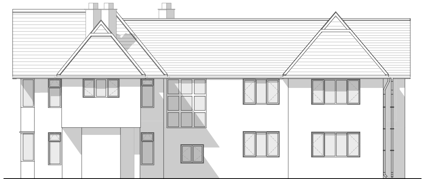
Proposed Side (East) Elevation