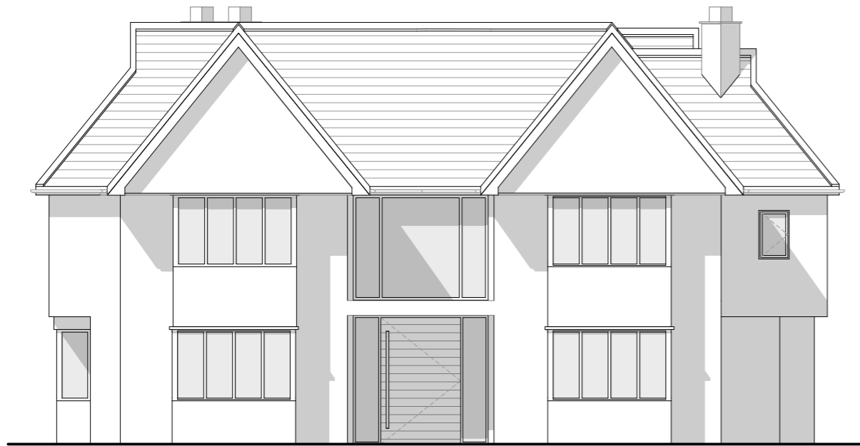
Proposed Front (South) Elevation