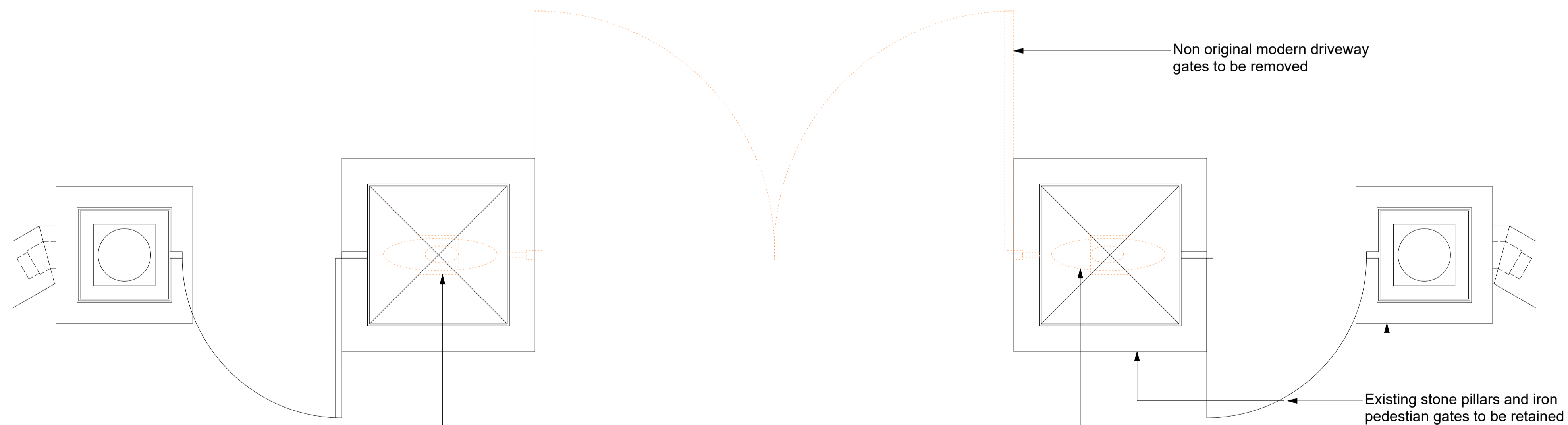
Proposed Entrance Gates Plan 1:20 @A1

Section of non original stonework to be removed. Reinstate top section of stone to match original as seen in historic photo