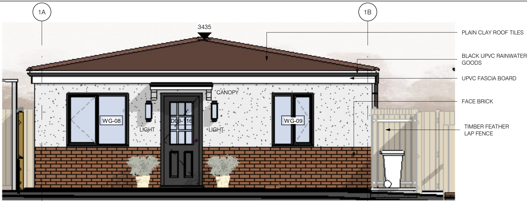
3 Proposed North Elevation 1 : 50