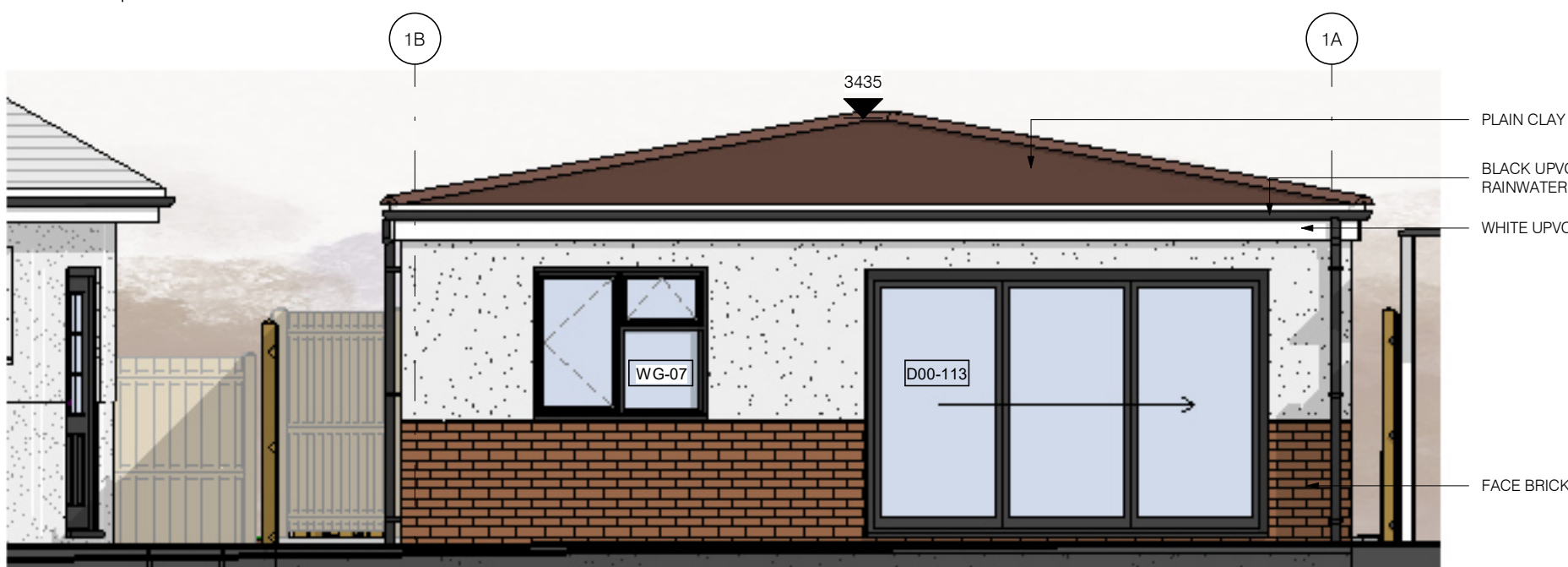
4 Proposed South Elevation 1 : 50