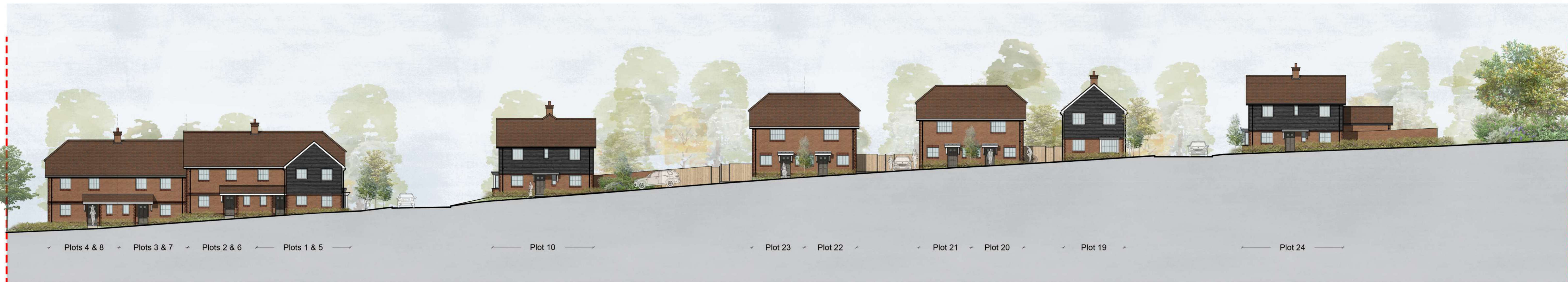
STREET SCENE 01