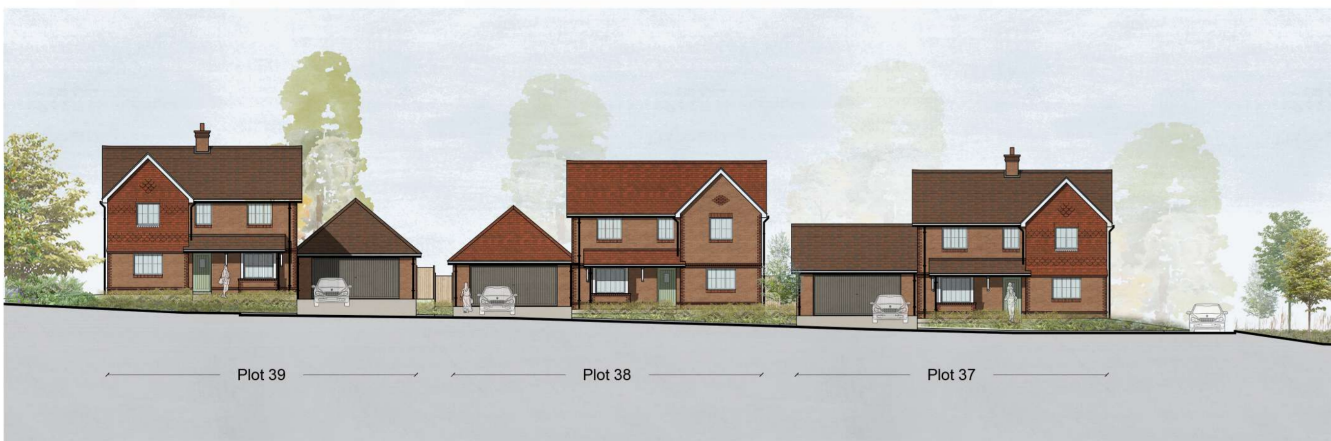
STREET SCENE 02