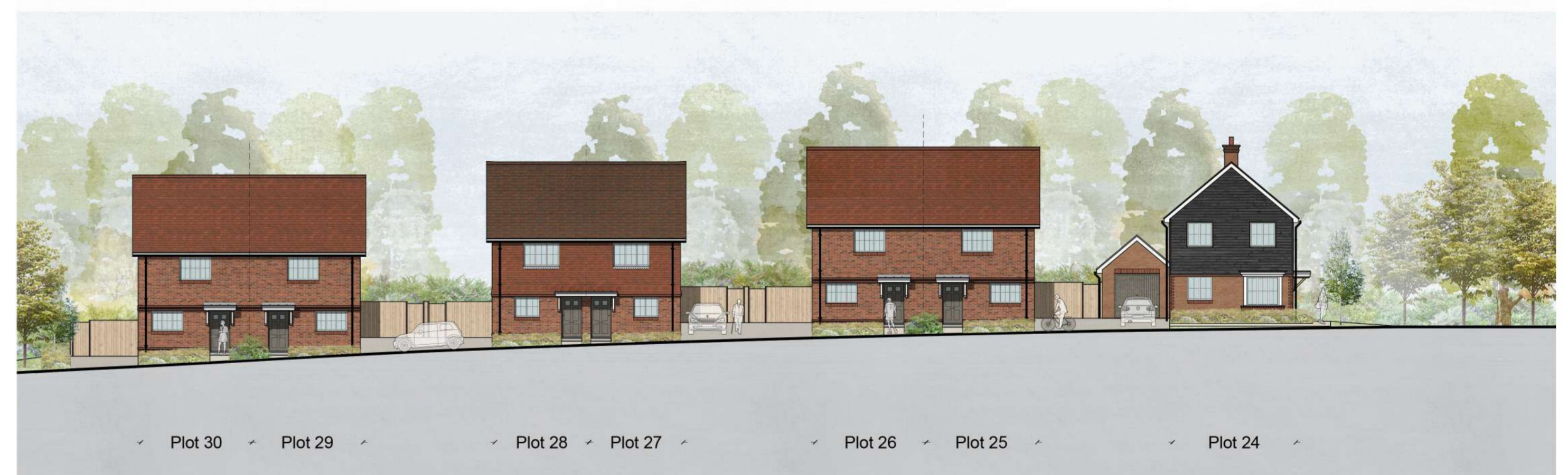
STREET SCENE 03