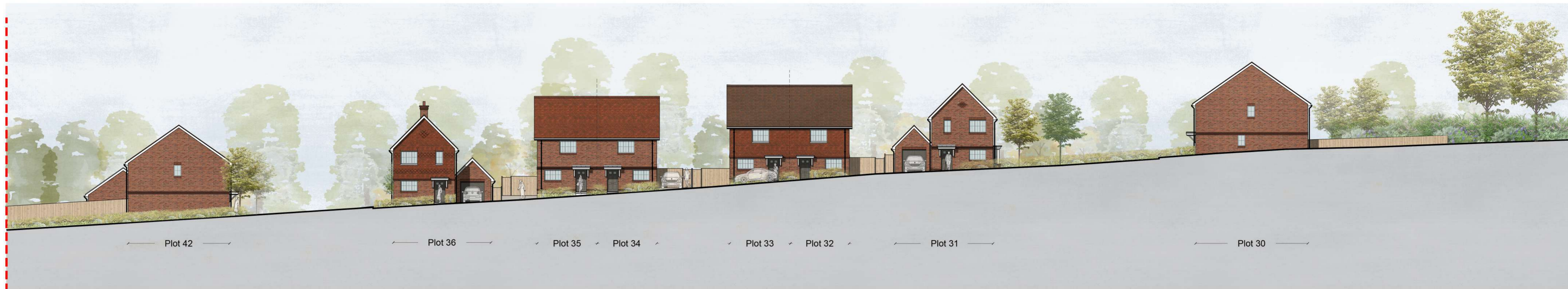
STREET SECTION A-A