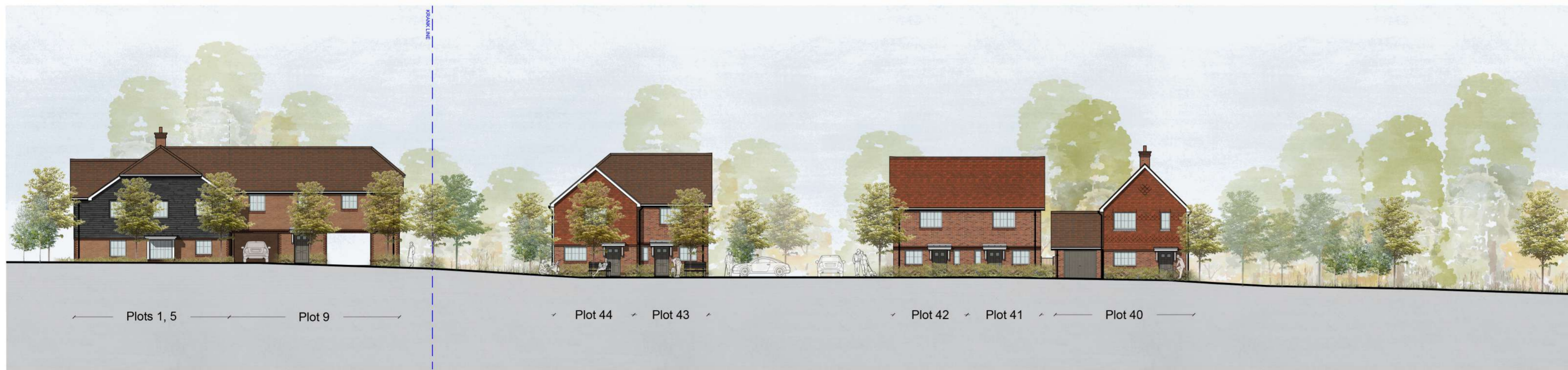
STREET SECTION B-B